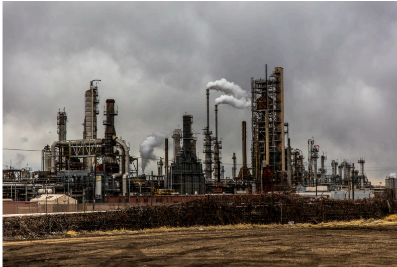
Photograph: “factories with smoke under clouds”

intended this reversal to be a symbolic end of the “war on coal” in order to “prevent these unilateral plans from increasing monthly electric bills by double-digits without any measurable effect on Earth’s climate.” Again, the cost-effectiveness argument is used for