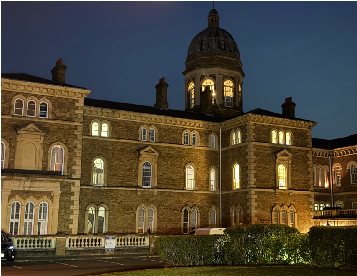
Princess Park Manor at night

The average rent price in Princess Park Manor is around £2,500 per month and the asking price for an apartment is £460,000 on average.