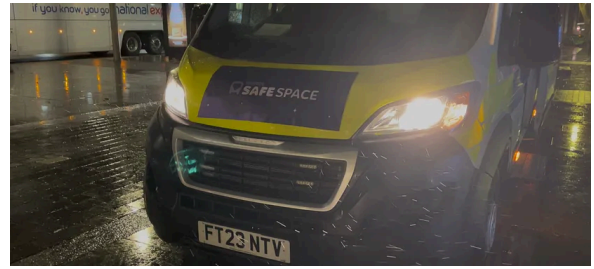
The Bristol Safe Space mobile unit

The service will offer a secure space for people to wait for friends, charge phones and arrange transport, and will provide access to talking support, crime reporting and basic first aid.