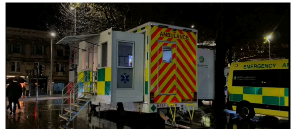
Bristol’s Alcohol Recovery Centre, run by ambulance staff

Safe Space will also signpost users to other outreach services in Bristol depending on their needs, including Bristol Street Pastors , Hope Against Suicide , Bristol City Centre Radio Scheme , and Operation BRIO.