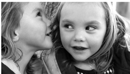
"You have a way of bringing out secrets in people."

As we sat together under the twinkly Shake Shack string lights, I thought about my friend sitting in front of me. Endlessly observant and expert at social intricacies, he was so spot on about people. I turned his assessment of me over in my brain. Secrets. Hmm.