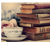
LOVING LIFE AS A NERD November 2, 2014