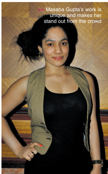
>> Masaba Gupta's work is unique and makes her stand out from the crowd