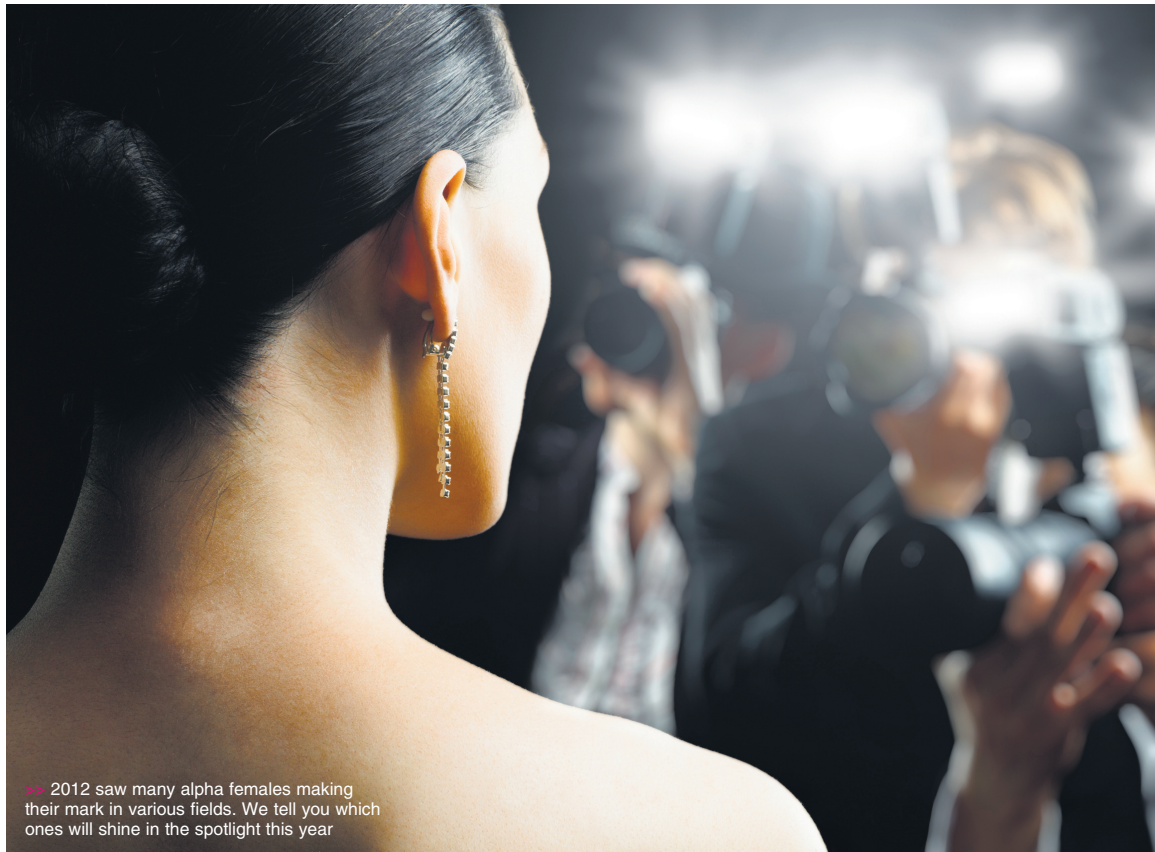
>> 2012 saw many alpha females making their mark in various fields. We tell you which ones will shine in the spotlight this year