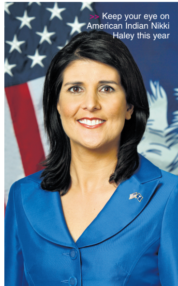
>> Keep your eye on American Indian Nikki Haley this year