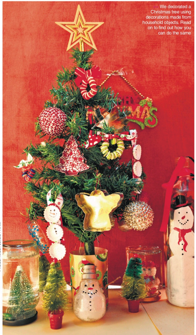
We decorated a Christmas tree using decorations made from household objects. Read on to find out how you can do the same

paper so that the desired pattern peeks through. Trace the outline, apply a thick coat of glue on the cutter and stick it to the sheet of paper to form a background. Press it down, then let it dry for 2-3 hours. Cut off any paper and pass some twine through it to hang it on your tree.