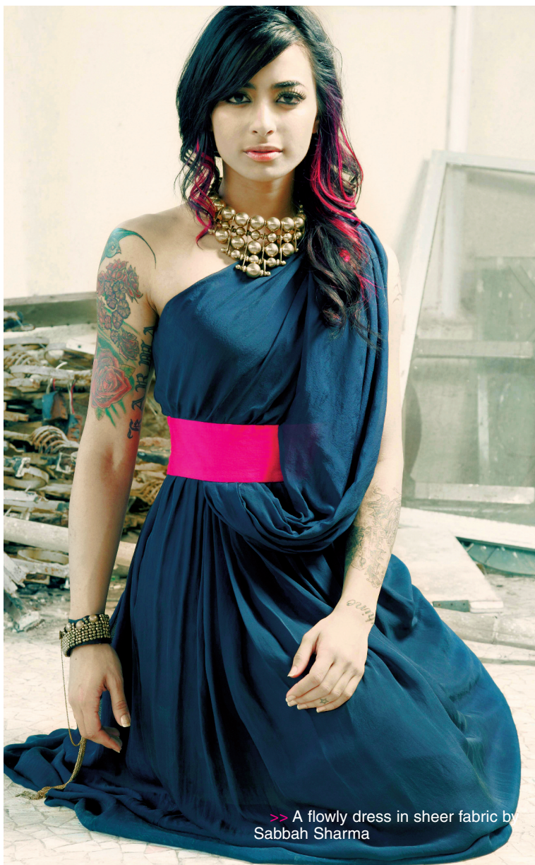
>> A flowy dress in sheer fabric by Sabbah Sharma