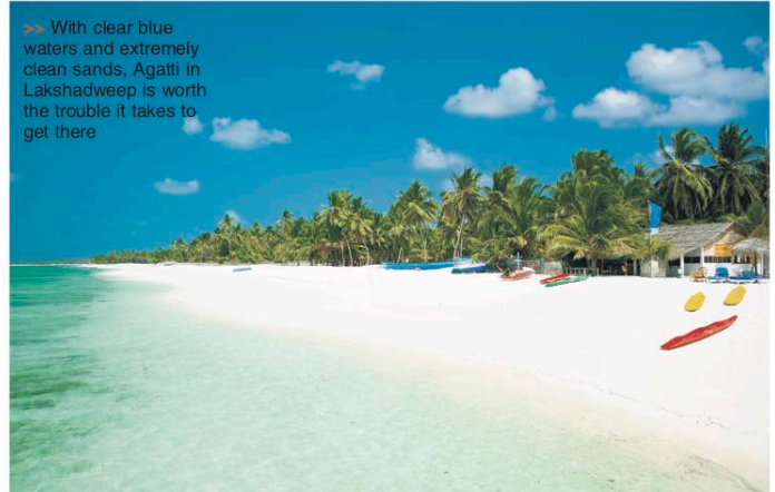
>> With clear blue waters and extremely clean sands, Agatti in Lakshadweep is worth the trouble it takes to get there