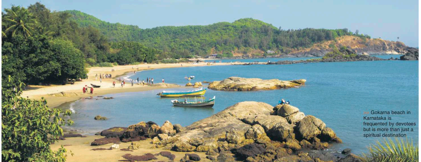
➤ Gokarna beach in Karnataka is frequented by devotees but is more than just a spiritual destination