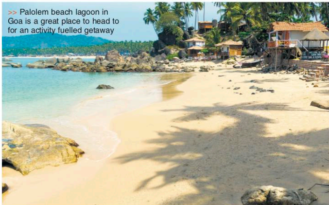
>> Palolem beach lagoon in Goa is a great place to head to for an activity fuelled getaway

Getting there: Andaman and Nicobar Islands is a destination that you should plan to visit in advance, paying attention to the minutest details. Sadly, there are no direct flights to the islands. You'll either have to change planes in Chennai or opt for flights with one stopover before they head to Port Blair. Once you're in Port Blair, you can take a ferry, seaplane or a helicopter — depending on your budget — which will take you to the Havelock Island. The official web portal ( www.and.nic.in ) lists the schedule and timings of the ferries and seaplane services.