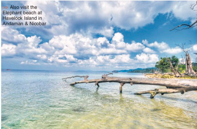
>> Also visit the Elephant beach at Havelock Island in Andaman & Nicobar