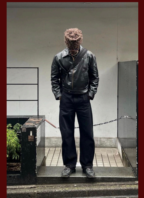
ACCESSORIES - MODEL #3

Shot 1: Monochromatic red outfit featuring a jacket and matching pants in sleek, structured material.