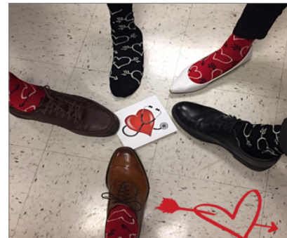
Cupid Application Team