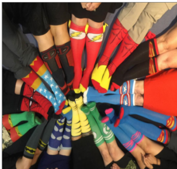
Clinical Documentation & Stork Application Teams