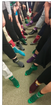
EpicCare Ambulatory Application Team