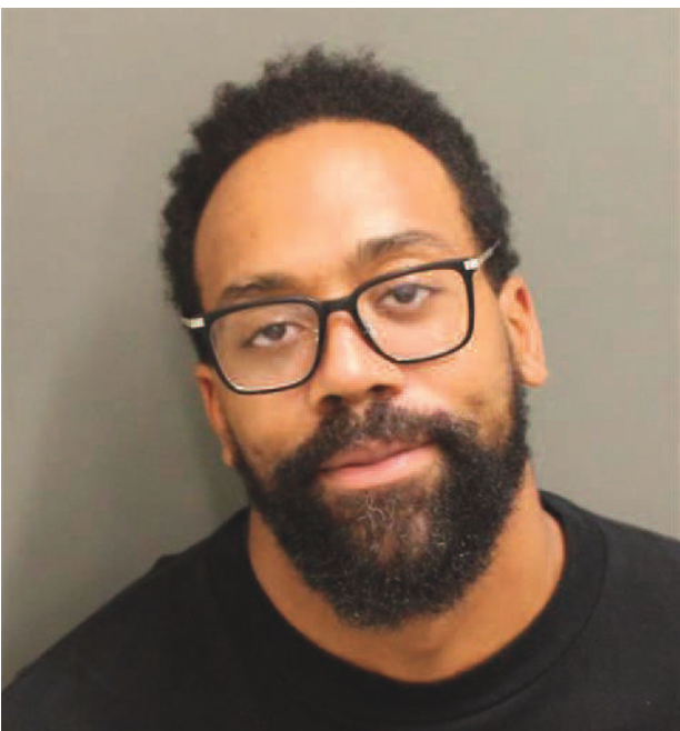
Marcus Jordan's mugshot.