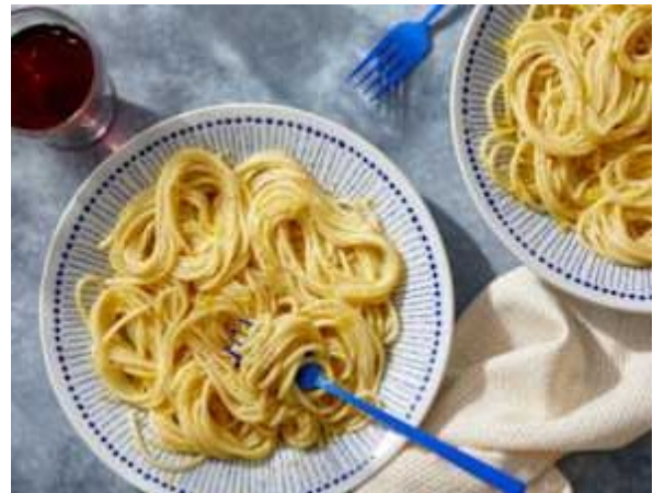
Take on a Challenge: Make Pasta Al Limone at Home