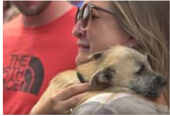
Heartwarming Reaction From a Couple Meeting Their Rescue Dog for the First Time