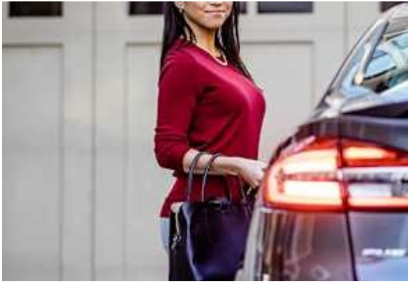
How Long Should I Keep My Car?