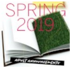
PW's Big Spring Books Preview