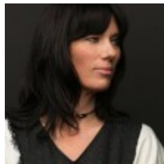
On Dogs and the Unique Hell of Writing Novels