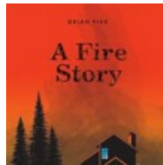
PW Picks: Books of the Week