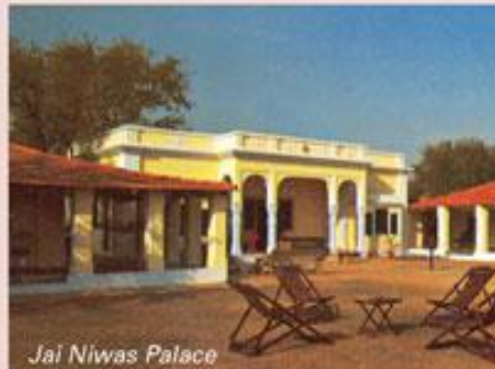
Jai Niwas Palace

wooden coat-stands. Here you can relish home-cooked south Indian as well as north Indian cuisine.