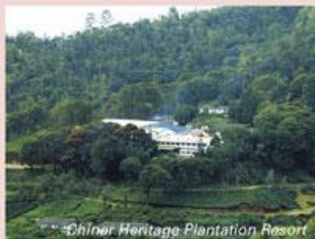
Chinnar Heritage Plantation Resort

Peemad: Located in the cardamom hills of Peemad in Central Kerala, WelcomHeritage's new property, Chinnar Heritage Plantation resort is a Raj-style Estate Bungalow. Set amidst Cypress and Flame of the Forest trees, the plantation resort is a single-storey bungalow built in semi-colonial style with four well-appointed ensuite bedrooms. The outhouse features two more bedrooms. The Tea Bungalow is furnished with 19 th century antique furniture – armchairs, easy chairs and