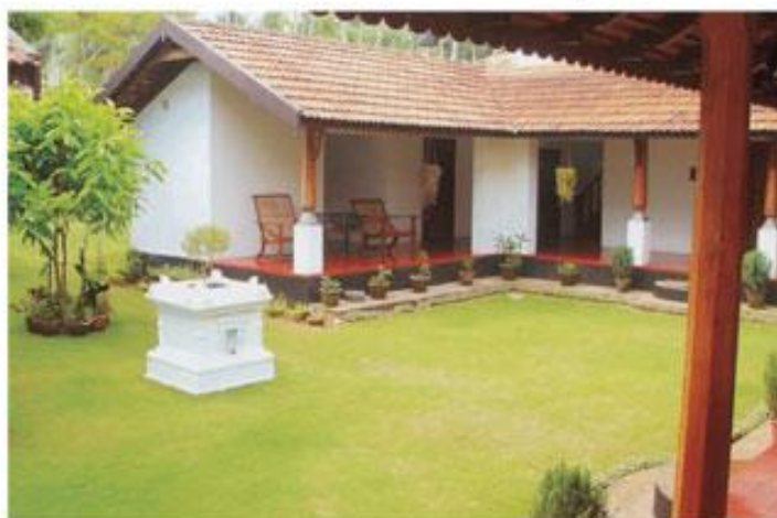
(Below) The ayurvedic resort, Harivihar in Calicut, offers an authentic experience of Kerala.