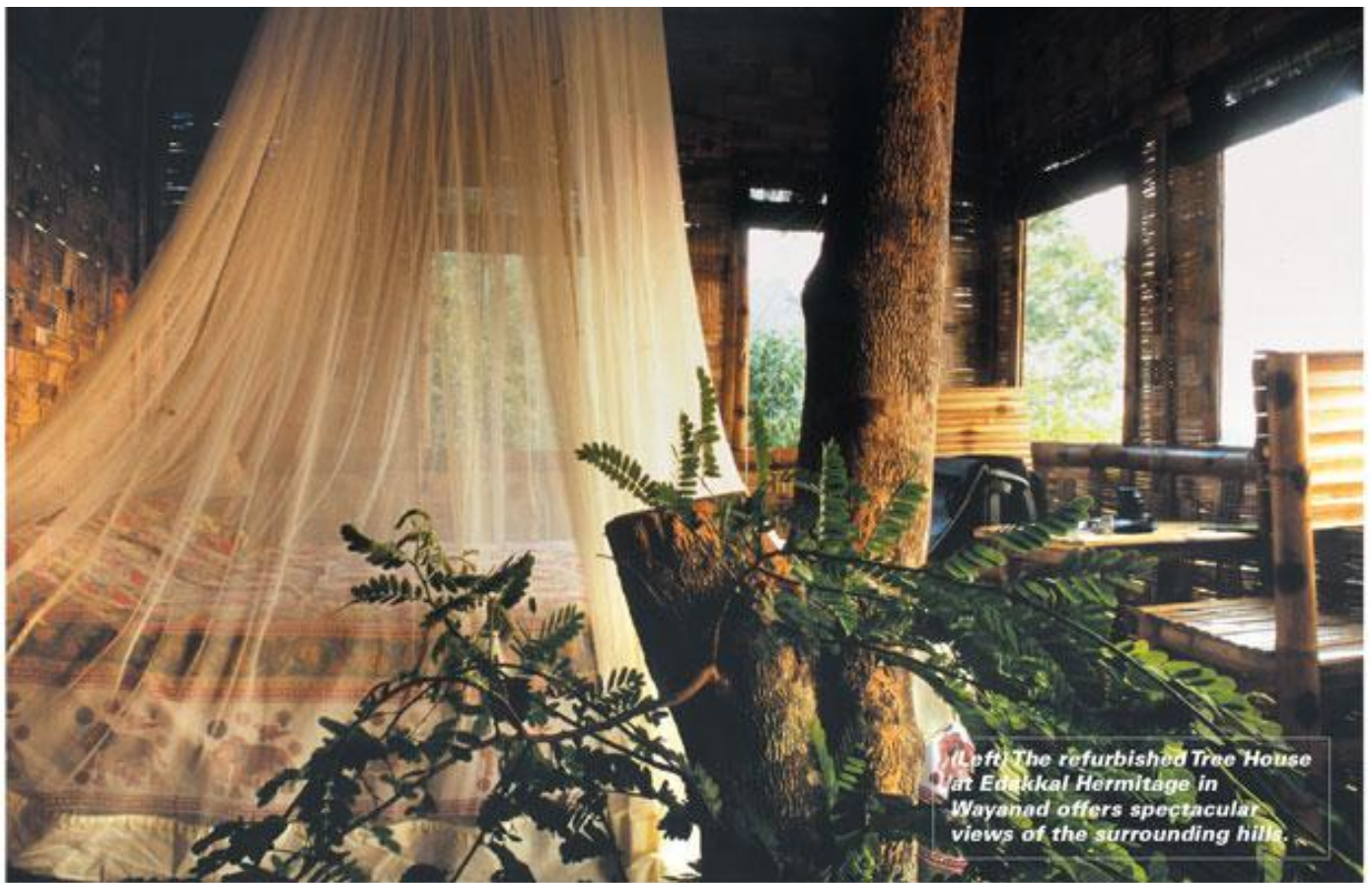
(Left) The refurbished Tree House at Edakkal Hermitage in Wayanad offers spectacular views of the surrounding hills.