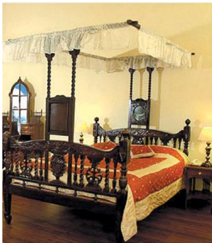
(Left) One of the refurbished rooms at Kasmanda Palace.

Located in a village in Palakkad, The Kandavath Tharavad , home to the Bhagladas family, has been welcoming people into their ancestral home for over eight years to share their heritage and age-old traditions. Recent additions here are the attached three-fixture bathrooms with provision for running hot water in all of the six rooms on offer. Electricity too which didn't feature earlier at the Bhagladas home has been a convenience for some seven months now. Albeit less charming but more convenient, bulbs and tubelights, have replaced the oil-lanterns of yore. More recently village walks and visits to the homes of local potters, basket-