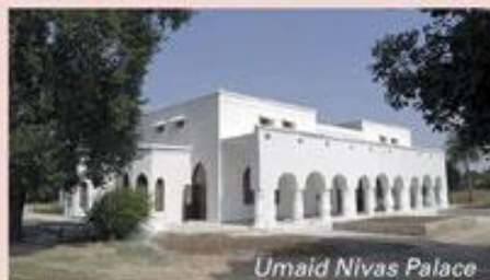
Umaid Niwas Palace