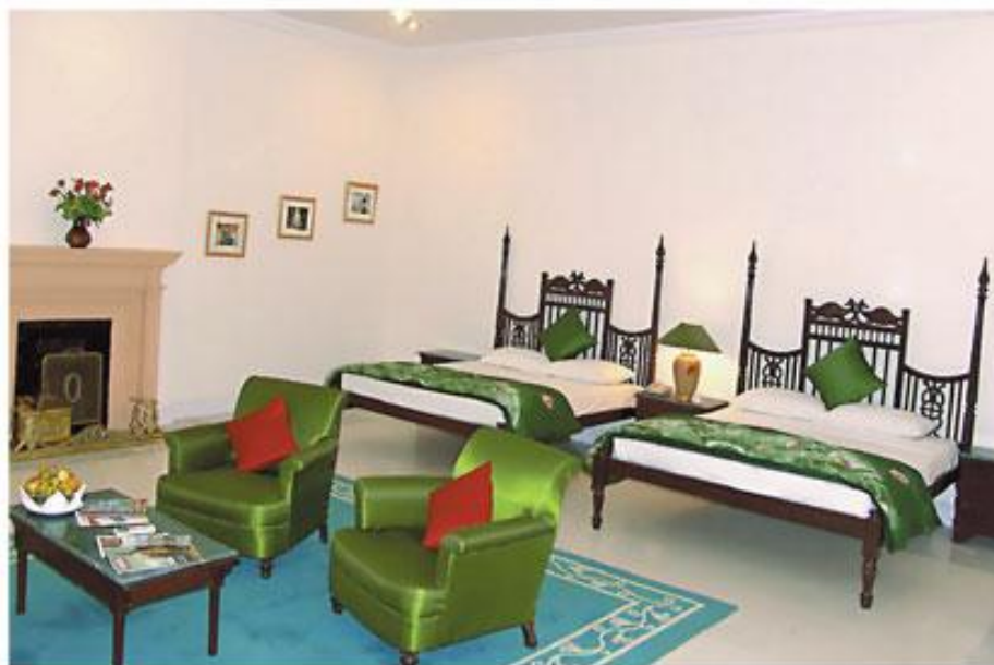
(Above) A recently upgraded room at the Lallgarh Palace Hotel in Bikaner.

J aipur's Narian Niwas Palace introduced a garden restaurant, which seats 80, recently. A bar has also been added that sports a traditional Rajasthani décor replete with frescoed walls, mirror work and plush dark brown arm chairs lit up by old-style glass chandeliers. A spa is currently under construction; the spa management company is yet to be finalized ( www.hotelnarainniwas.com ).