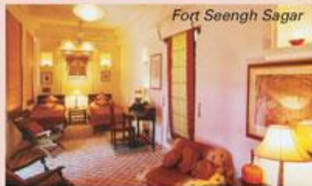
Fort Seengh Sagar