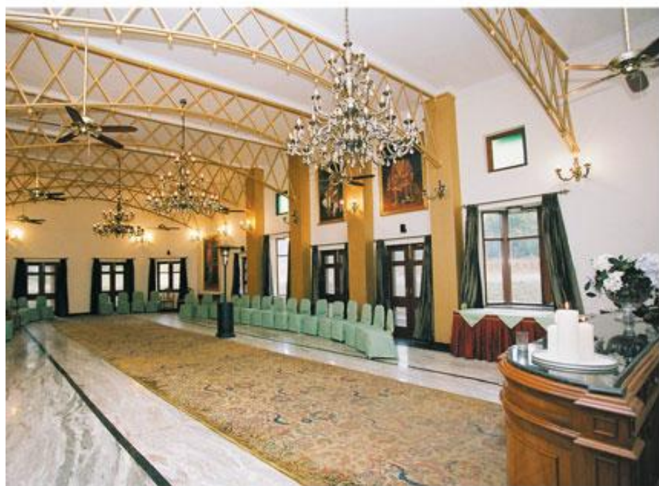
(Below) One of the recently renovated rooms at the Noor-Ussubah Palace in Bhopal.