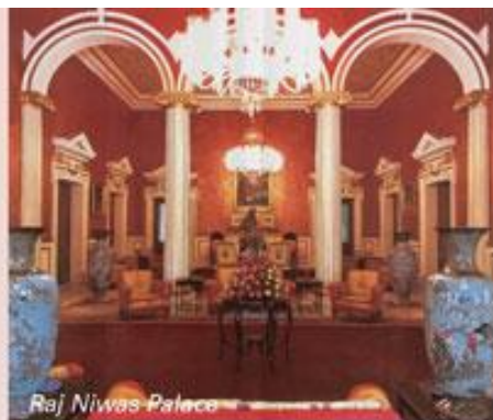
Raj Niwas Palace