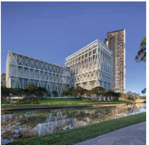
ABOVE East view of Powerhouse Parramatta, opening in 2023.

LEFT Istanbul Modern.