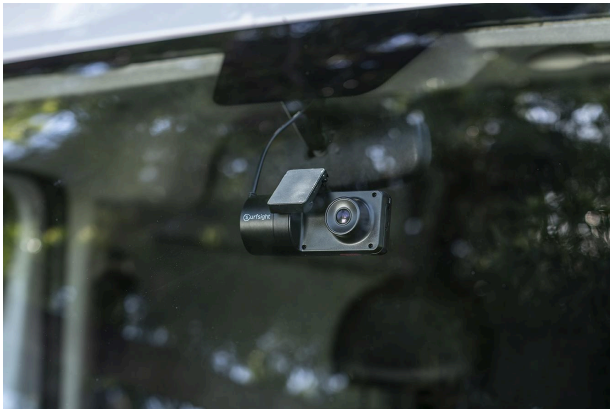
[alt text: Surfsight dashcam attached to front windshield]