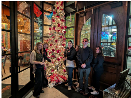
The Community Connections team at the Arc Convention in Charlotte, NC.