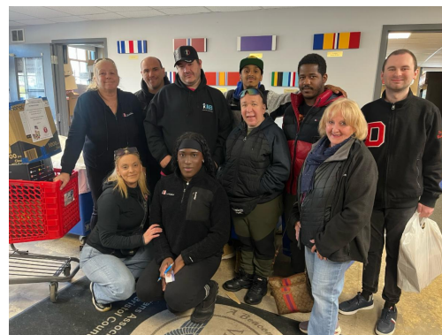
Community Connections participants and staff giving back to people in need.