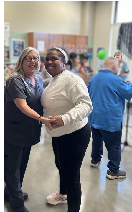
Staff and participants alike enjoyed the music in Mashpee.