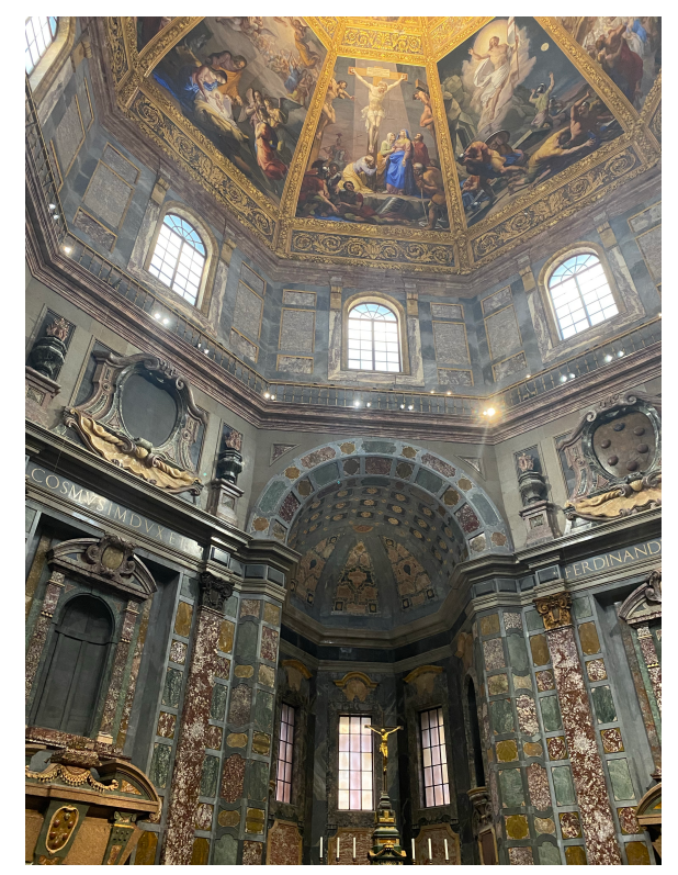
Medici Chapels: The Chapel of the Princes