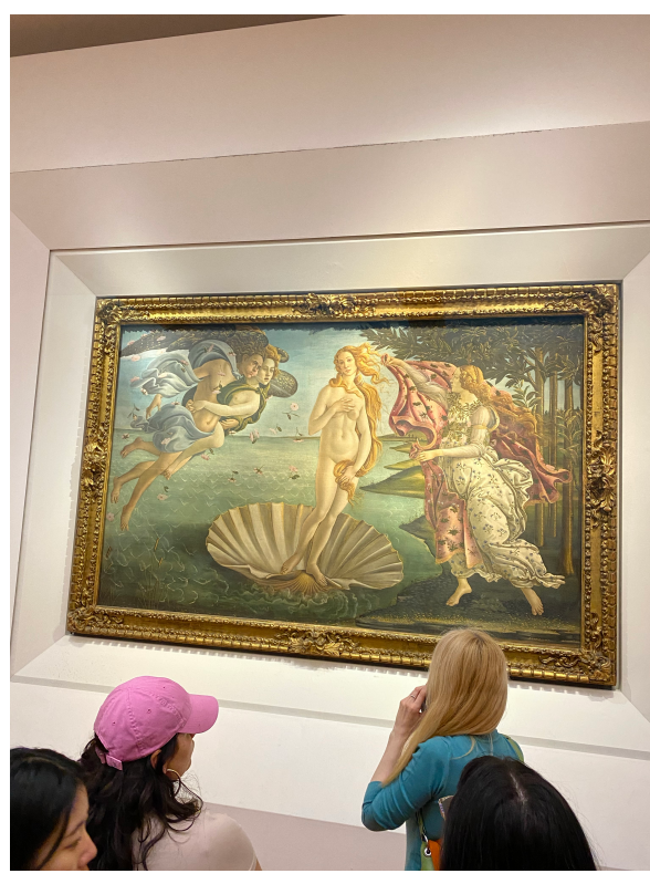
'The Birth of Venus' by Sandro Botticelli at Uffizzi Gallery.