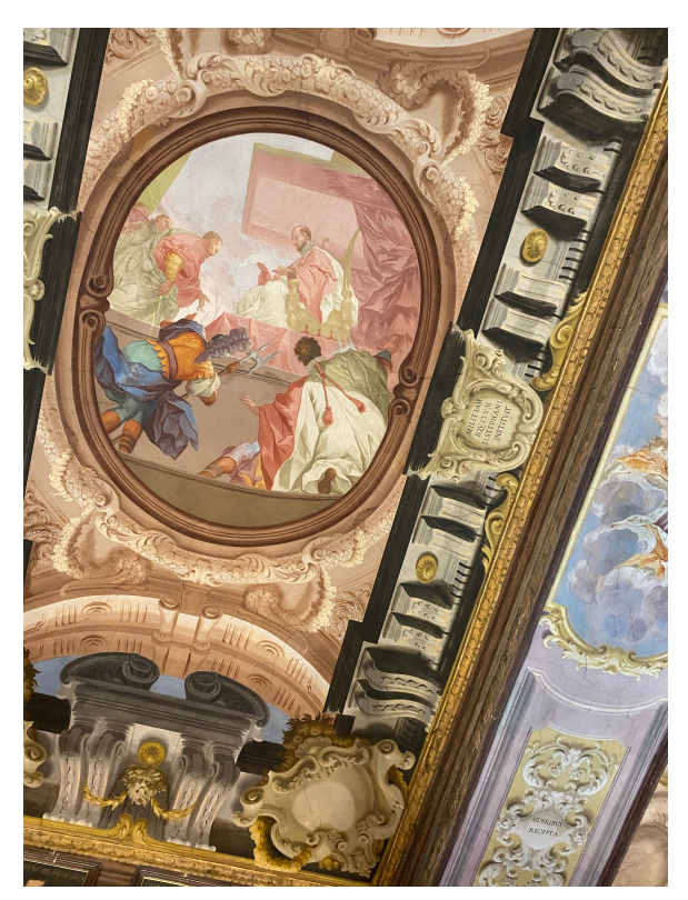
Uffizzi Galleries Ceiling