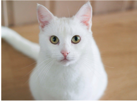
Ariel after CC's medical assistance

✂----- cut here to return top portion with your gift-----✂