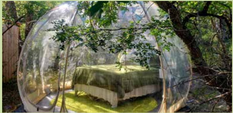
Stay in Style Overlooking the banks of the Arkansas River, the Royal Gorge Yurts' location at the heart of the adventure action is one of its many amenities. Above: The bubble tent in a private forest is one of three unique accommodation options at the dreamy Runaway Ranch in Beulah Valley.

For those who dare to be different, the Bubble Dome near Cripple Creek awaits. This two-room marvel offers air-conditioned comfort with a view like no other. Enjoy the serenity from the king-size bed, furnished with privacy curtains