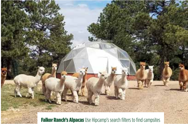
Falkor Ranch's Alpacas Use Hipcamp's search filters to find campsites and glamping setups on farms, vineyards, and more. Below , Collective Vail's luxe tent with private deck and attached spa bath.