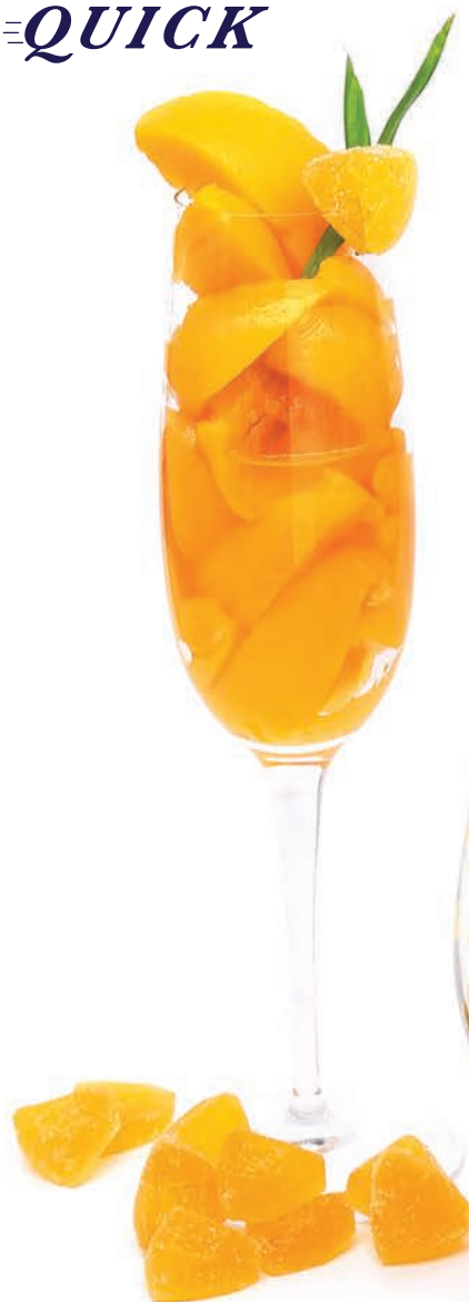
PEACH BELLINI SATIVA