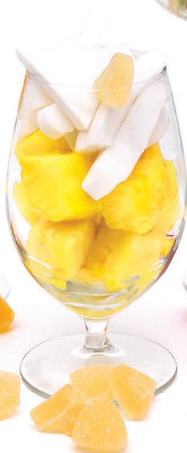
PINA COLADA INDICA