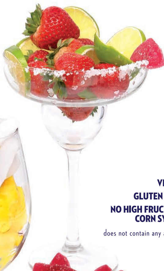
STRAWBERRY MARGARITA WITH A HINT OF SALT CBD/THC 1:1

VEGAN GLUTEN FREE NO HIGH FRUCTOSE CORN SYRUP