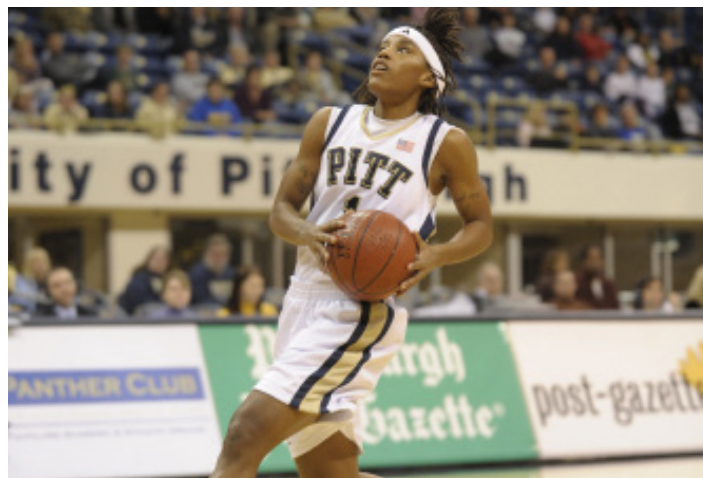
Pitt great Shavonte Zellous is the last Pitt player to score 40 points in a game as she netted 42 in a win over Florida on Dec. 21, 2008.