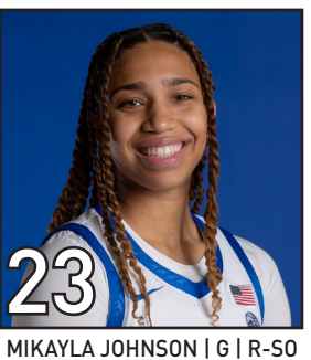
Anchorage, AK Bartlett (Colorado)