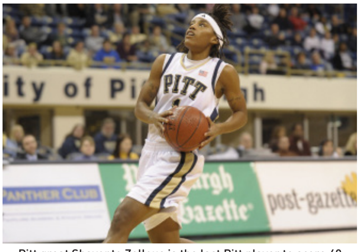
Pitt great Shavonte Zellous is the last Pitt player to score 40 points in a game as she netted 42 in a win over Florida on Dec. 21, 2008.