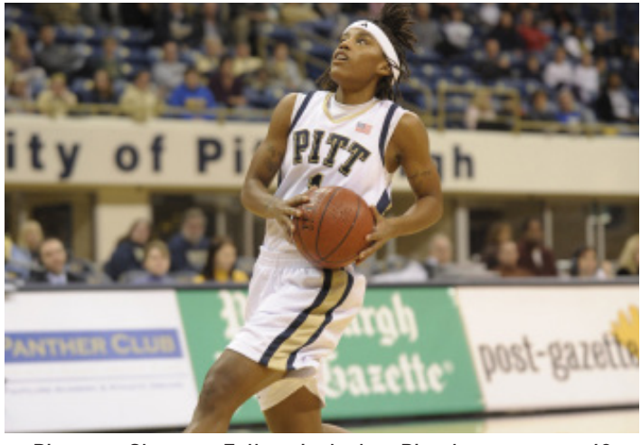
Pitt great Shavonte Zellous is the last Pitt player to score 40 points in a game as she netted 42 in a win over Florida on Dec. 21, 2008.