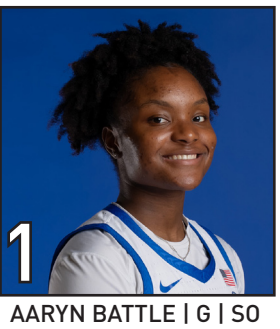
Sewell, NJ Camden Catholic