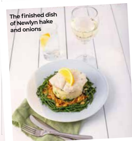
The finished dish of Newlyn hake and onions