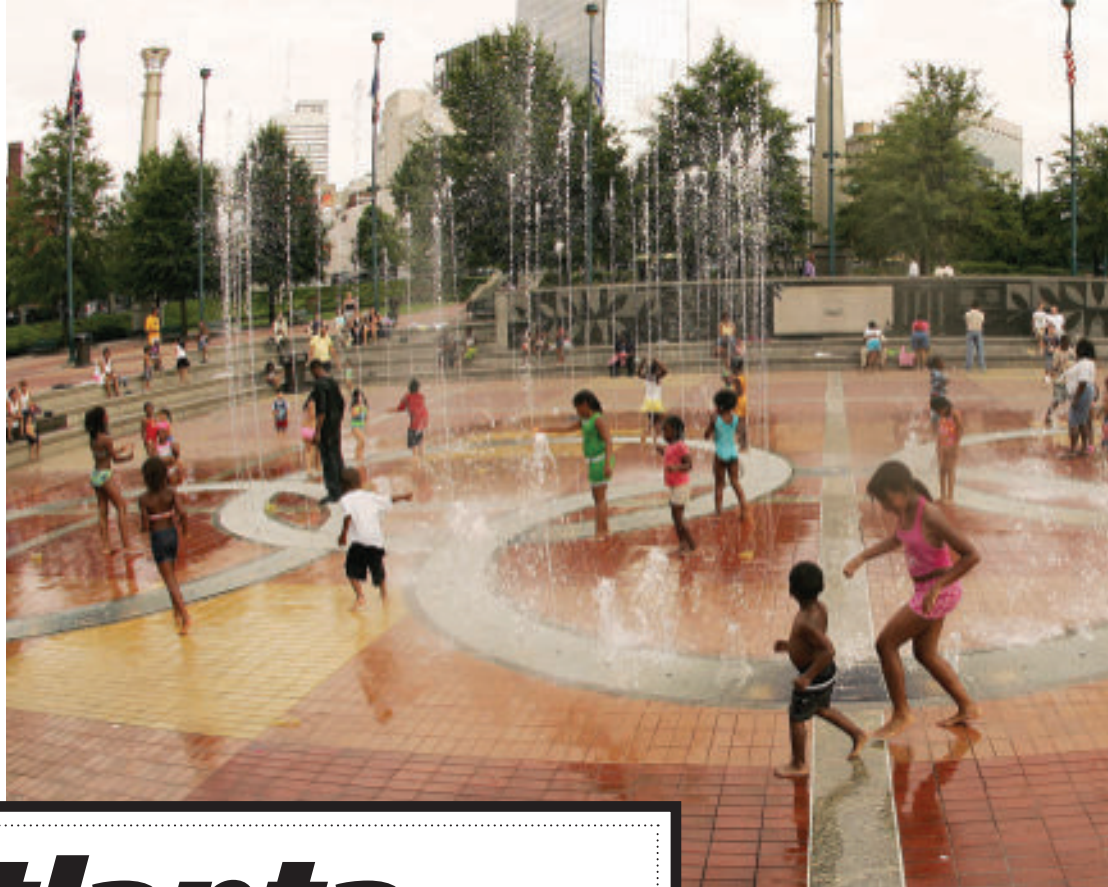
Centennial Olympic Park was built for the 1996 Olympic Games, but now serves as a gathering place for locals and visitors.