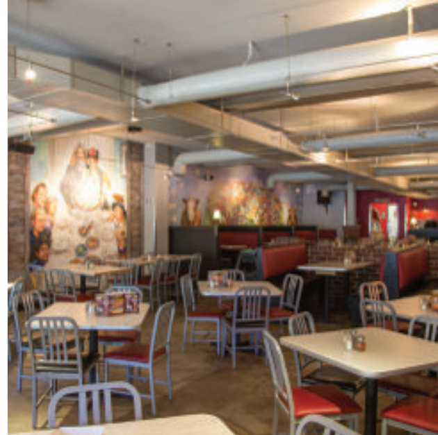
With a hip downtown atmosphere and delicious pizza, Mellow Mushroom has quickly become a favorite hangout for locals.

For more information visit savannahriverboat.com .