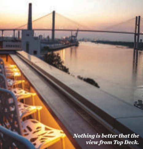
Nothing is better than the view from Top Deck.