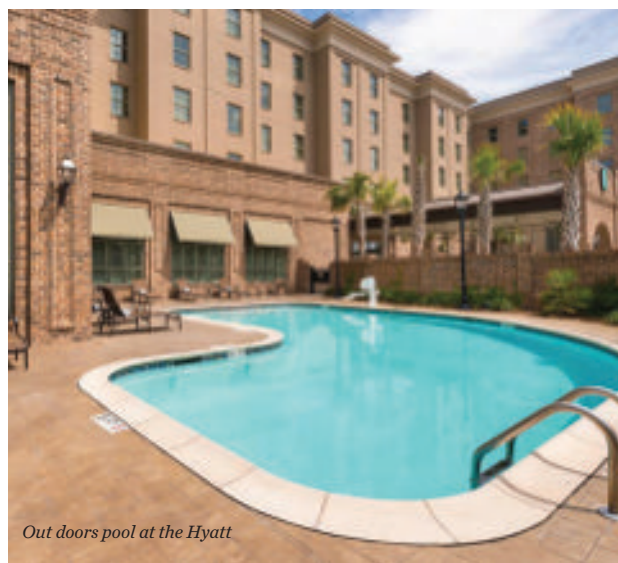
Out doors pool at the Hyatt

* If you're looking to be within walking distance to some of Savannah's best attractions, be spoiled with impeccable service, and have killer views of both the city and the river, you should be staying at the Hyatt . Right smack in the middle of River Street, the Hyatt Regency Savannah has long been one of Savannah's favorite hotels. savannah.hyatt.com