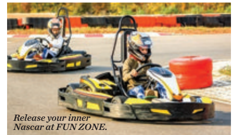
Release your inner Nascar at FUN ZONE.

With go-kart tracks, miniature golf, and one of the biggest arcades in the area, Fun Zone offers something for children, teens and adults alike. poolerfunzone.com