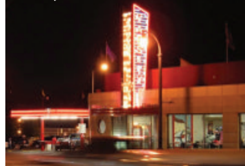
The Varsity Drive in

* Built for the 1996 Olympic Games as a gathering spot for visitors and residents, Centennial Olympic Park is now a beautiful 21-acre park in the heart of downtown Atlanta. While there, visit the Fountain of Rings , the centerpiece to the park. It's the world's largest interactive fountain and is in the shape of the Olympic Ring symbol. centennialpark.com