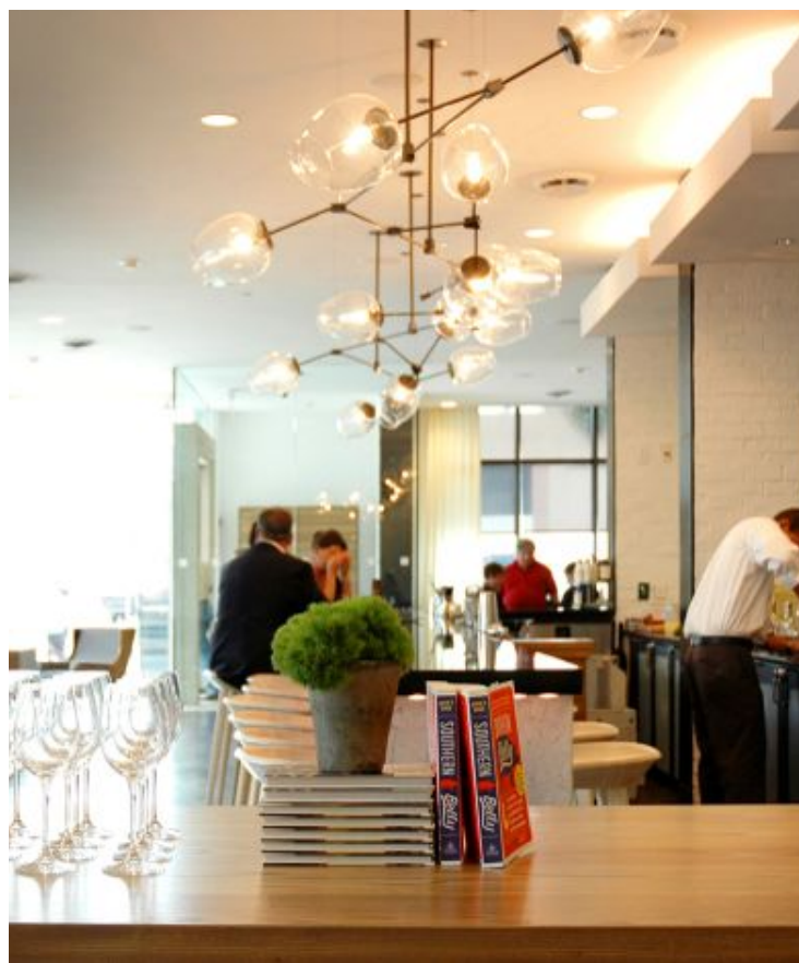
▲ A beautiful view from the Andaz

✱ Savannah has deep roots, deep history, and even deeper secrets. To get a full understanding of her mystery, you have to take a walking tour. There are no better tour guides than the folks at Noble Jones Tours . Their guides are walking encyclopedias of Savannah's history and culture. Through every cobblestoned street and monument-filled square, your guide at Noble Jones will bring you accurate historical recounts, interesting facts, and entertaining tidbits about Georgia's First City. You'll leave your tour feeling like you know Savannah better than you know yourself. For more information about tour offerings or to schedule a tour with Noble Jones, visit noblejonestours.com .