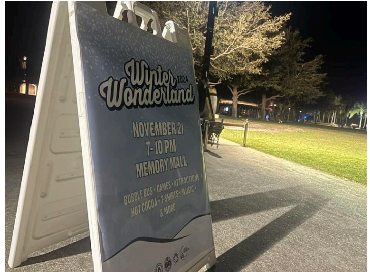
The main entrance to Winter Wonderland, an event Thursday organized by the Campus Activities Board at Memory Mall.

Students took pictures on the rides and with the many inflatable snowmen, smiles everywhere. They gave their opinions on social media, and on CAB's Instagram page, one user is already giving the board ideas to set up a big hedge maze in the Memory Mall field.