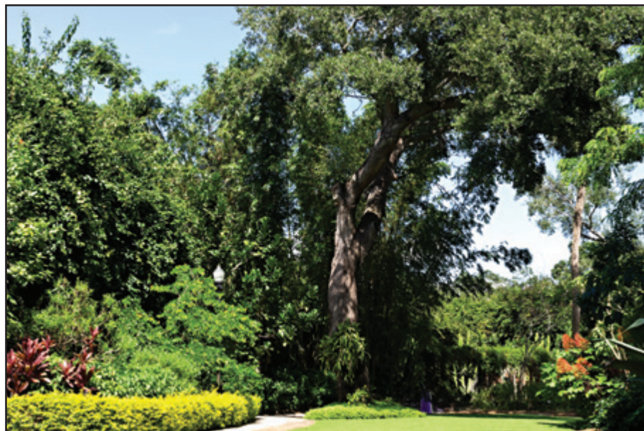
Tree canopies grace many pathways.