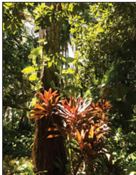
Lush surroundings greet visitors at every turn.

The community took up the mantle in the 1990s, working to preserve the gardens. By 1998, Sunken Gardens was designated as a protected local historic landmark. In 1999, the historic main entrance was placed on the National Register of Historic Places. The attraction is now owned by the city of St. Petersburg. 📍