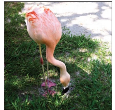
A flamingo forages for its meal.

Hard times hit in the '80s when Orlando was developed as a tourist location, putting