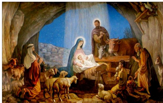
Jesus in the manger