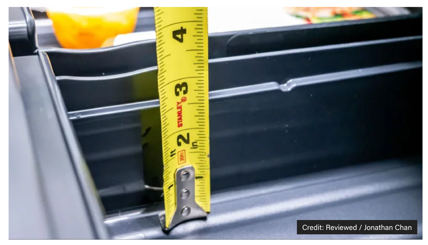
You can't items that are taller than 2.5 inches in the DryZone, limiting your options.

The DryZone comes in two cramped 8.5-inch by 11-inch long by 2.5-inch tall sections. You can't stand a can of soda up in there. We understand that the giant divider between the two sections is for organizing, but we think the design would offer more storage if it had one large tray with a removable piece.