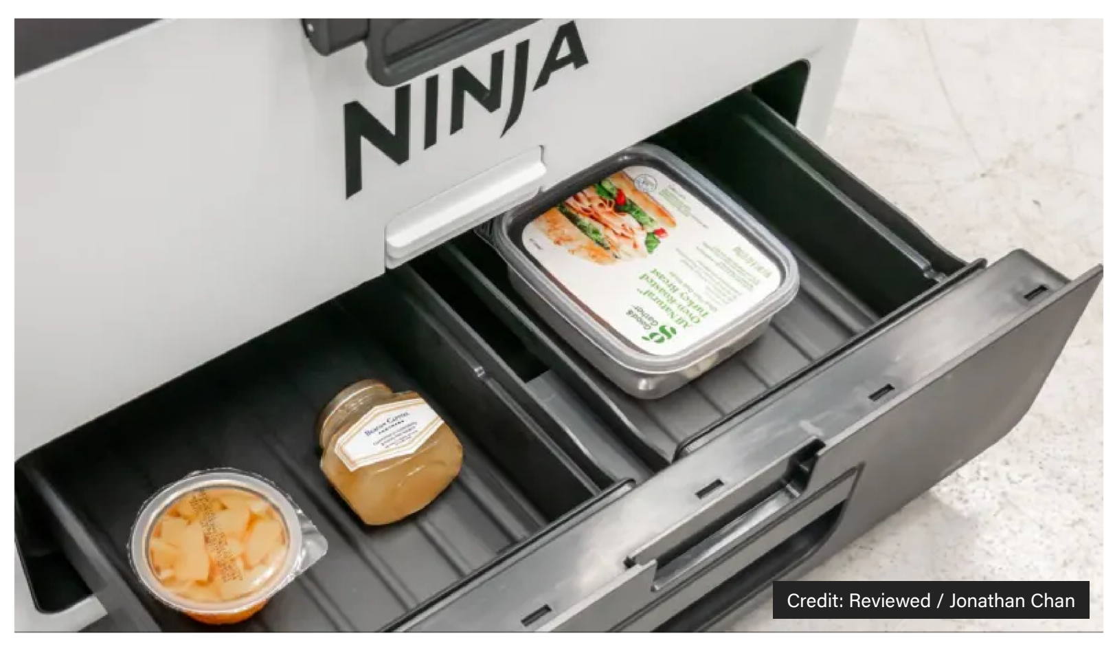
The DryZone is a drawer under the main cavity that slides open.

The DryZone, a compartment underneath the main cavity where you place the ice, is a standout feature of the Ninja FrostVault. It chills the vault without direct contact, ensuring your items stay dry. This design not only prevents your hand from getting drenched in melting ice but also provides easy access to your chilled items.