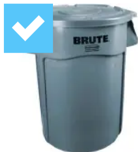
BEST VALUE Rubbermaid Brute 32 Gal. w/Lid