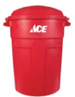
Rubbermaid Ace 32 Gal.