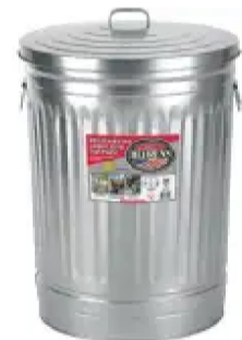
Behrens Galvanized Steel 31 Gal.