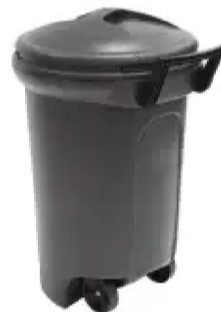
United Solutions TB0042 Wheeled 32 Gal.