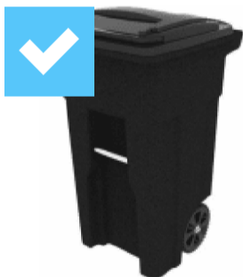
BEST OVERALL Toter Wheeled Blackstone 32-Gal.