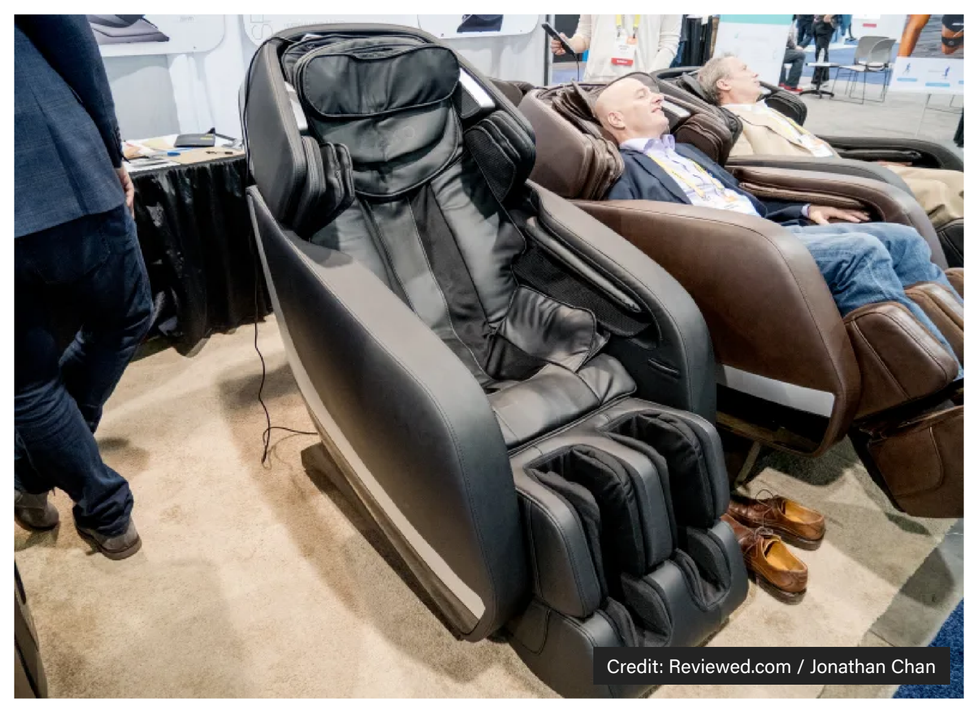
The Adako massage chair focused on my lower body, for better and worse.

Adako is much like the Regina, but it's supposed to specialize in buttock massages. Nice. The new 2017 model also has bluetooth capabilities so you can pair it with your smart phone, allowing you to play music through the headrest. I felt like it didn't hit as many points as the Regina L, but it did as advertised. The seat vibrated and had rollers in it. After the massage ended, my legs felt a little sore. This massage chair dug pretty hard into my feet, too. Overall I was satisfied with what this chair had to offer, but I was no closer to my goal.