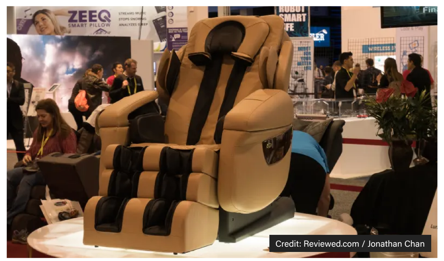
The Luraco clamped down on my legs, and reclined, stretching me out.

The Luraco was the last massage chair I tried. It's unique in that at some point, the chair clamped down on my legs, leaned back, and stretched me out like a gentle torture rack. After that demo session was done, I was too. My lower back and feet felt sore enough that I didn't want to stand in another line.