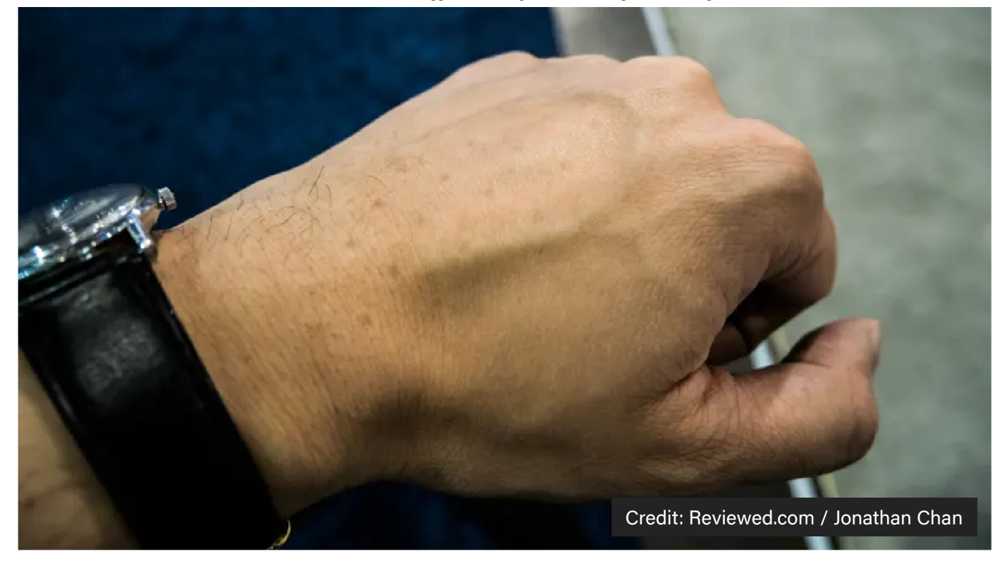
The Regina L left an impression on me.

When I got up I noticed there were welts over my hands. The Regina L has shelves where your arms go. In there, beaded cloth presses down on your hands to help alleviate tension. After getting up, I felt none the worse for wear, but I didn't feel any cooler. So, I went off in search of another massager.