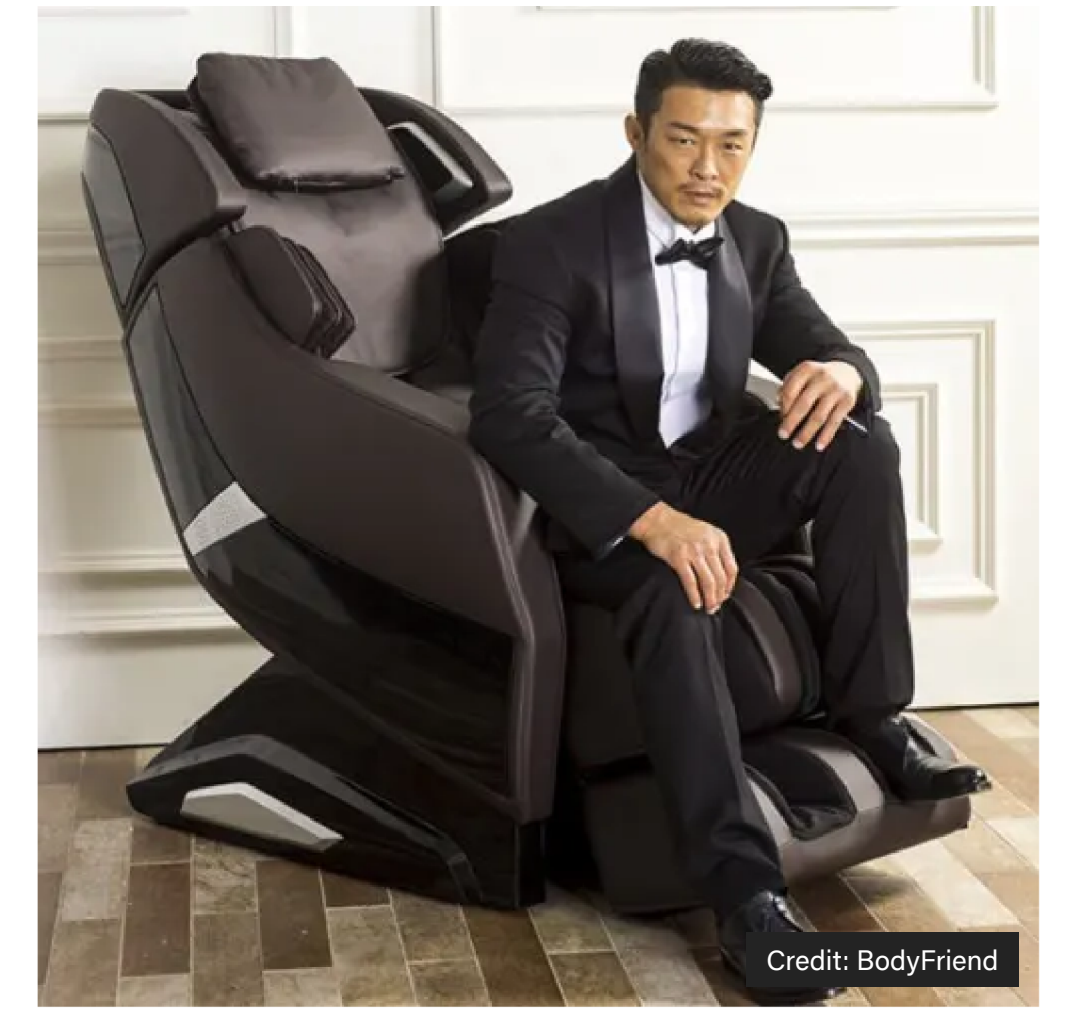
I started trying massage chairs because I wanted to be like this guy.

Look at how cool this guy is. Could I be this cool? Are massage chairs the answer? I resolved to try as many as my body would tolerate.