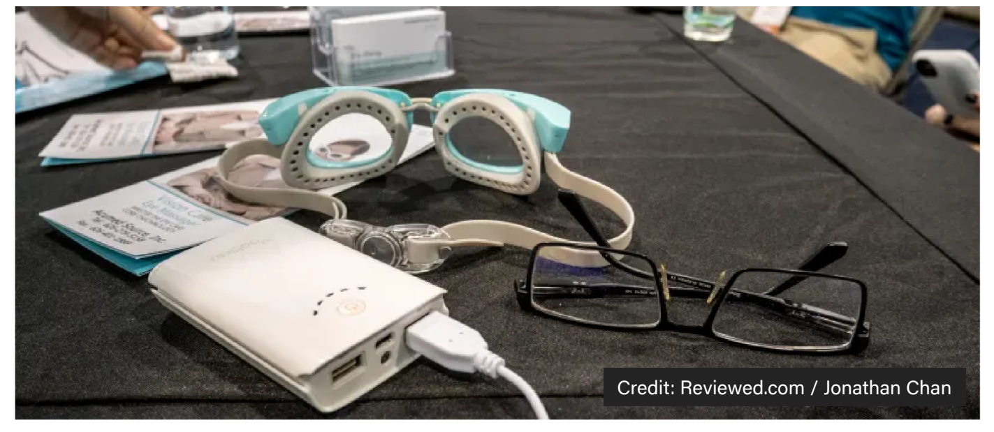
I could see through the goggles while I got my eye massage.

I took them off after they started making me sleepy. Since it's advertised that they help with insomnia, I guess that's a good sign. Overall, I liked that I could continue to do stuff while I had the goggles on. Since the whole unit is portable, you can take Vision Care wherever you roam. For me, that was to the next massager.