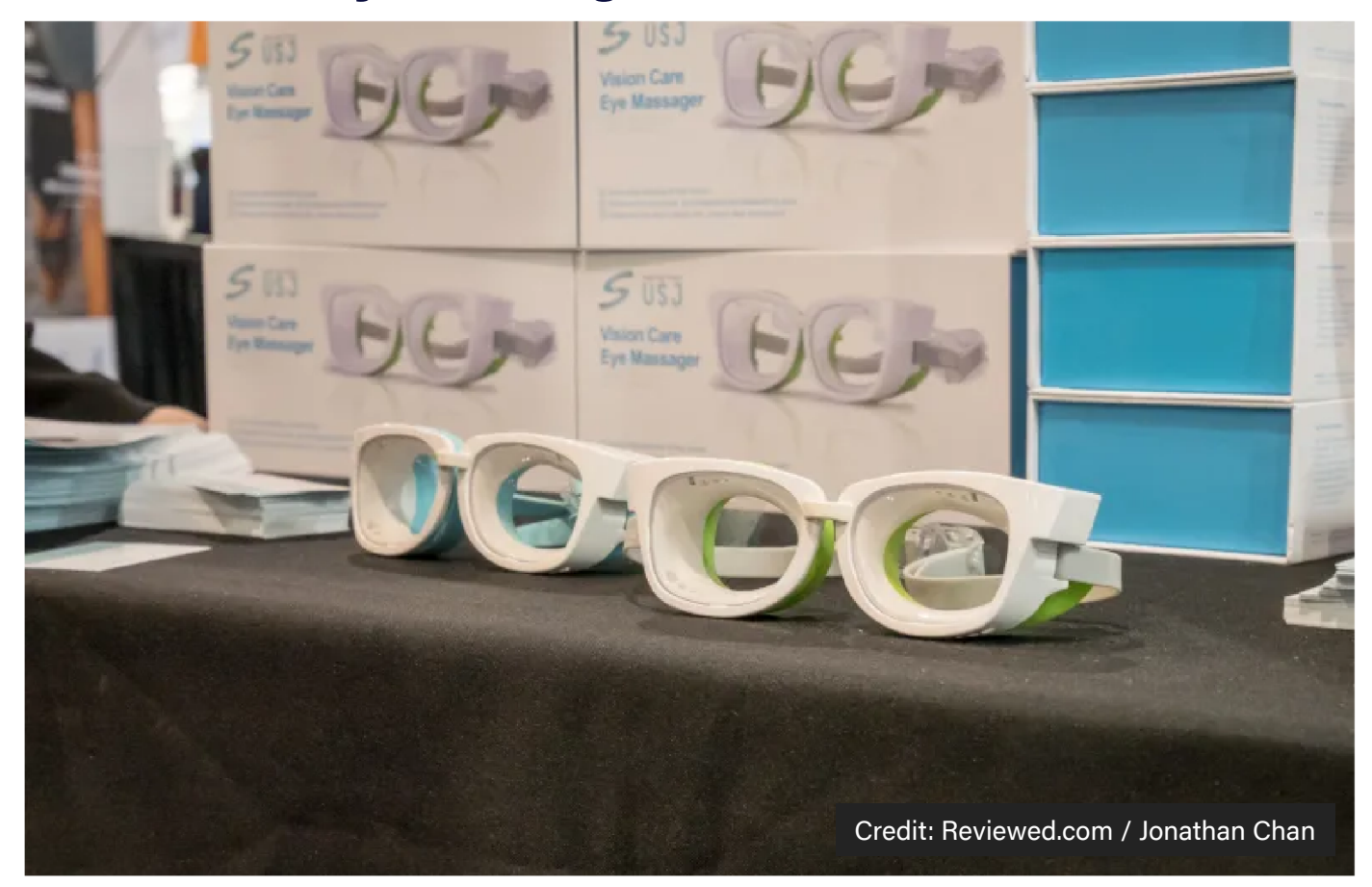
The Vision Care eye massager, vibrated my eye sockets, and blasted hot air into my retinas.

The Vision Care is rather unique. I don't think I've ever seen a massager than focuses