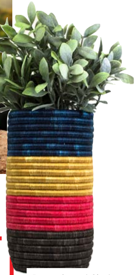
Poppy Sunset Sisal Vase, $36, by ALL ACROSS AFRICA , accompanyus.com .

Handwoven by Rwandan artisans, each vase is made with fair trade practices and varies slightly in color and size.