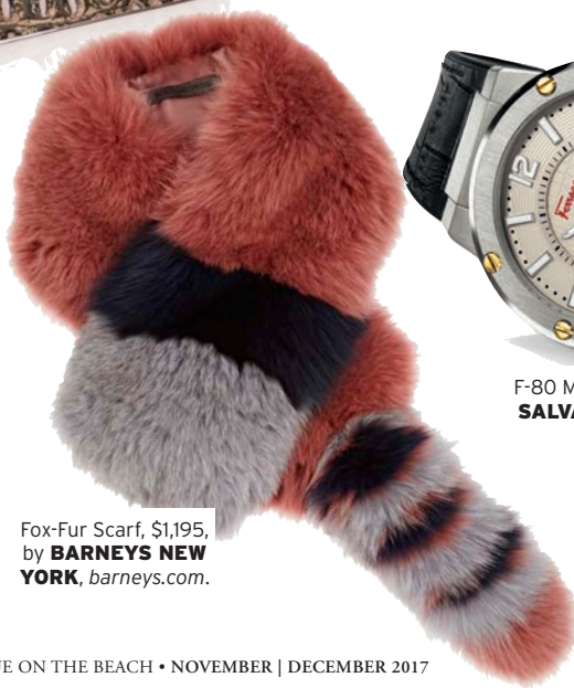
Fox-Fur Scarf, $1,195, by BARNEYS NEW YORK , barneys.com .

Wren & Roch is helping the United Nations to promote the advancement of the Sustainable Development Goals, specifically Goal #5, to achieve gender equality and empower all women and girls.