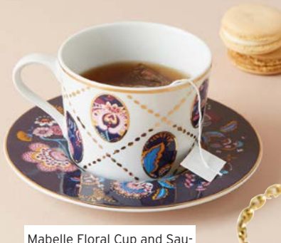
Mabelle Floral Cup and Saucer, $24, by LIBERTY FOR ANTHROPOLOGIE , anthropologie.com .