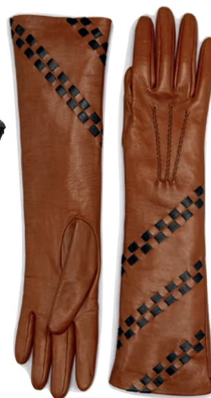
Leather New-Nero Gloves in Soft Nappa, $490, by BOTTEGA VENETA , 800.845.6790.