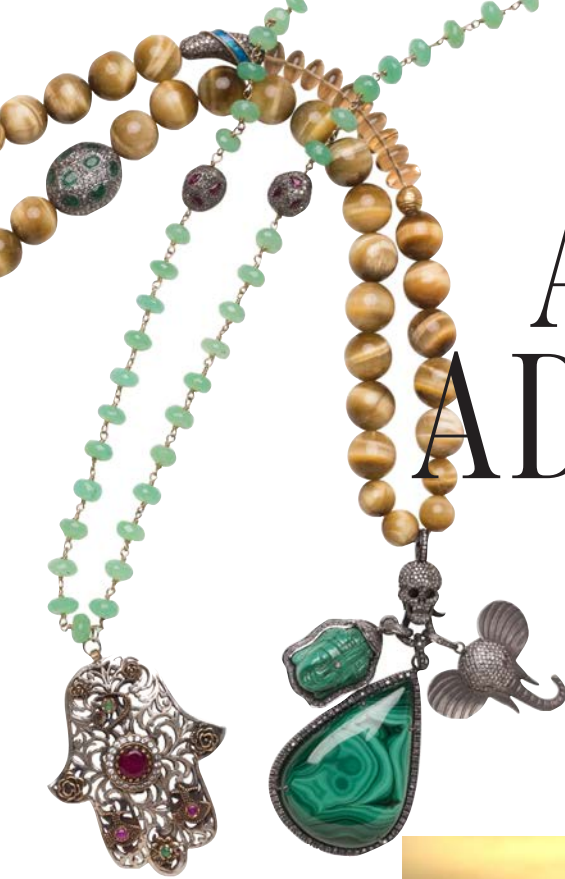
Necklace with chrysanthemum, rubies and silver, $3,500; and Necklace with yellow tiger eye, agate and diamond by CLARISSA BRONFMAN , $7,700 Bergdorf Goodman, bergdorfgoodman.com