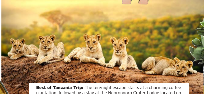
Best of Tanzania Trip: The ten-night escape starts at a charming coffee plantation, followed by a stay at the Ngorongoro Crater Lodge located on the rim of the UNESCO World Heritage Site. Next, head to the Mwiba lodge, which offers walking safaris, cultural interactions and night drives. End your stay with a flight to Serengeti and visit the Singita Sasakwa safari lodge, by INDAGARE TRAVEL , indagare.com .