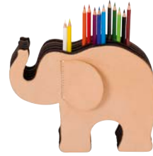
Crossroads Slides, $275, by CHARLOTTE MOSS FOR IBU , ibumovement.com .