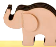
Elephant Desk Accessories, $215/small, $250/medium, $300/large, by GRAF VON FABER-CASTELL , Fountain Pen Hospital, fountainpenhospital.com .