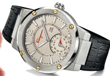
F-80 Motion Watch, $1,395, by SALVATORE FERRAGAMO , ferragamo.com .