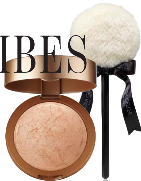
All Over Glow 2-Piece Kit, $45, by LAURA GELLER , laurageller.com .

Make Me Blush Bag, $435, and gold chain strap, $95, by WREN & ROCH , wrenandroch.com .