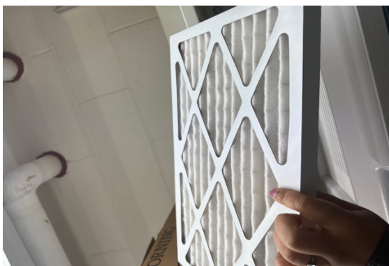
TOP OF FILTER