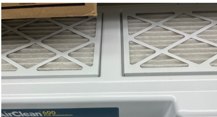
2 PRE-FILTERS ON TOP OF PCR HOOD