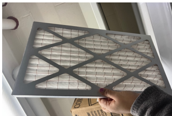
BOTTOM OF FILTER