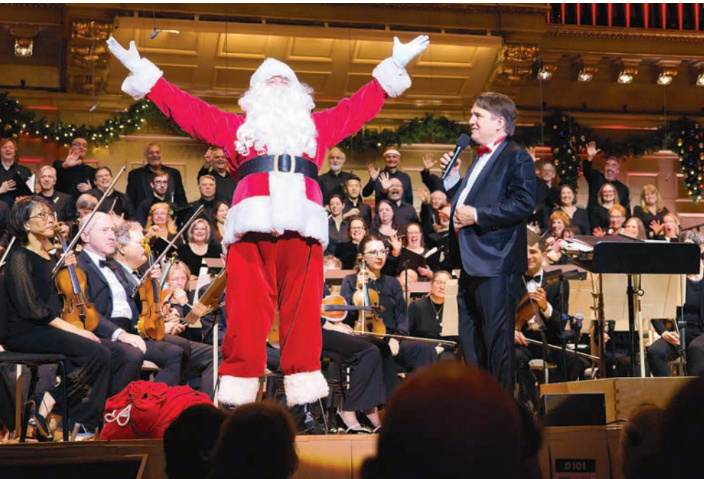
Santa Claus onstage with Keith Lockhart and the Boston Pops.

From holiday happenings to gallery exhibitions and community events, there is a lot going on in Back Bay and Beacon Hill this month.