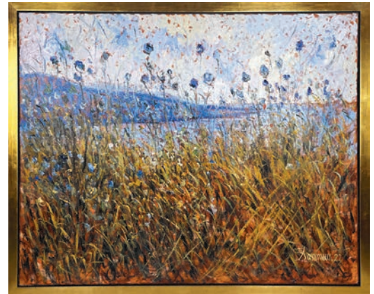
Galerie d'Orsay presents "Samir Sammoun: The Way Home." Photograph by Samir Sammoun