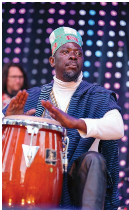
Arts and culture come alive at First Night Boston.

pick and choose what to attend, while stopping home to warm up between. Events are free and include concerts, cultural performances, arts and crafts, improv, ice sculptures, the First Night parade (6 p.m.), and the family fireworks (7 p.m.). Free.