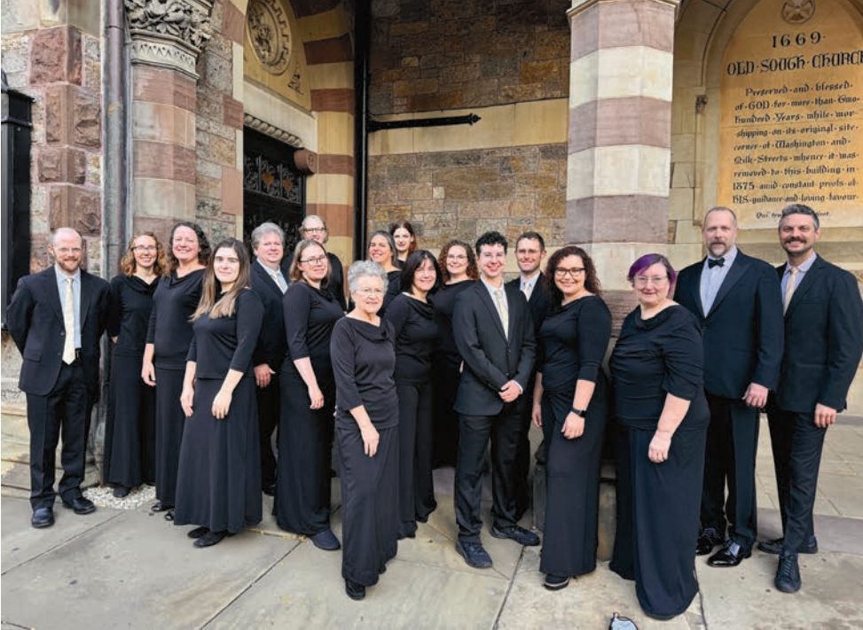
Back Bay Ringers take over Emmanuel Church in mid-December.

Dec. 14, 4 p.m. and 7 p.m. Dec. 15, 2 p.m.