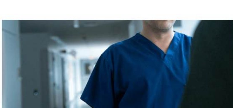
Dr. Christopher Duntch (Joshua Jackson) speaks with a patient's family.

"Dr. Death" is based on the true story of Dr. Christopher Duntch (Joshua Jackson), a well-respected neurosurgeon in Texas. After building his own practice from the ground up, his patients suddenly start coming out of surgery with permanent disabilities or in body bags. Two fellow surgeons and a Dallas prosecutor team up to take him down.