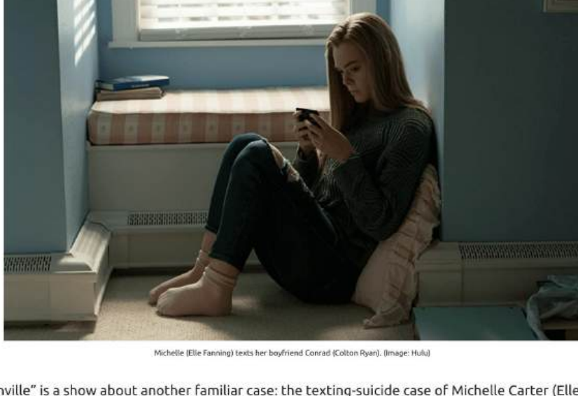
Michelle (Elle Fanning) texts her boyfriend Conrad (Colton Ryan).

"The Girl From Plainville" is a show about another familiar case: the texting-suicide case of Michelle Carter (Elle Fanning) and Conrad Roy III (Colton Ryan). The case was the first of its kind, setting a precedent for future cases. The show features real text-message conversations between the two, showing Carter's emotional manipulation that led to her conviction for involuntary manslaughter.