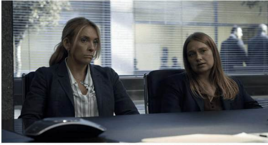
Detectives Grace Rasmussen (Toni Collette) and Karen Duvall (Merritt Wever) team up to get the FBI involved in a case.

The miniseries "Unbelievable" follows the story of two female detectives, Grace Rasmussen (Toni Collette) and Karen Duvall (Merritt Wever), who follow up on a reported rape. The victim, Marie Adler (Kaitlyn Dever), has recanted her story because of her treatment by the responding officers, but the detectives follow a string of clues that lead them to a case much larger than originally suspected.