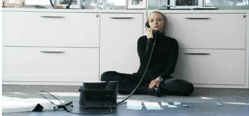
Elizabeth (Amanda Seyfried) sits on the floor of her office and speaks on the phone.

"The Dropout" is a TV miniseries about the rise and quick fall of Theranos and Elizabeth Holmes (Amanda Seyfried). After dropping out of college, Elizabeth starts a tech company to revolutionize the health-care industry, claiming its Edison test could detect diseases without using needles.