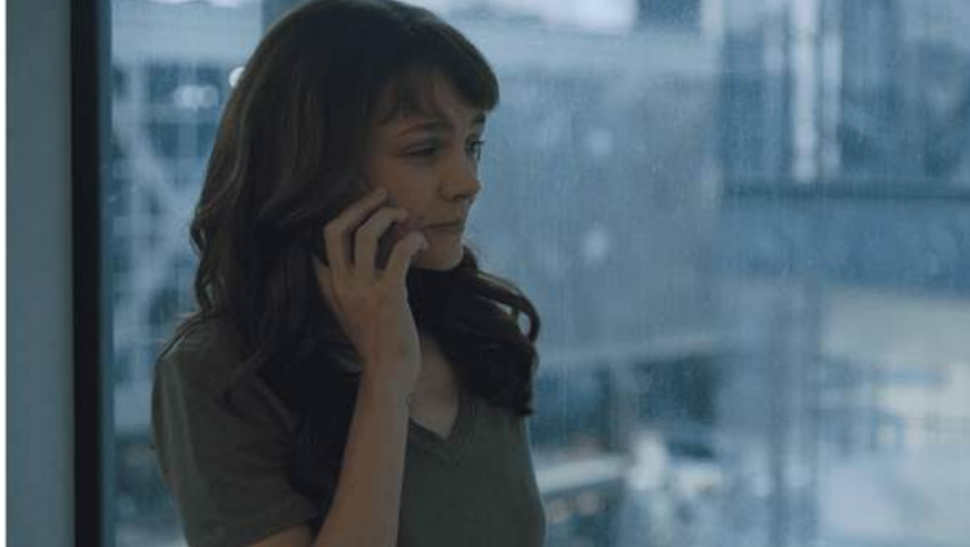
Megan (Carey Mulligan) speaks with a source on the phone.

We all know the basics of the Me Too movement's beginning, but maybe not all the gritty details of how the first story came out. "She Said" follows two journalists, Megan Twohey (Carey Mulligan) and Jodi Kantor (Zoe Kazan), as they dig up the story of Harvey Weinstein. Our favorite part of this movie is its realism and the way it isn't overly dramatized, which gives viewers a look into what it's truly like to be a journalist.