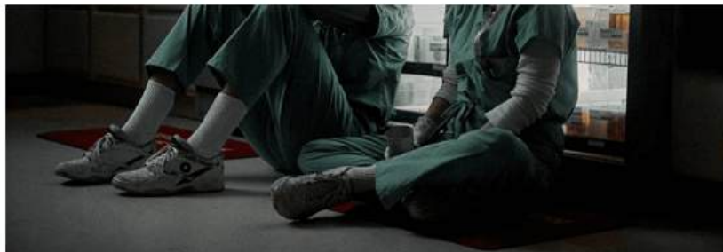
Charlie (Eddie Redmayne) helps Amy (Jessica Chastain) after she has a heart problem.