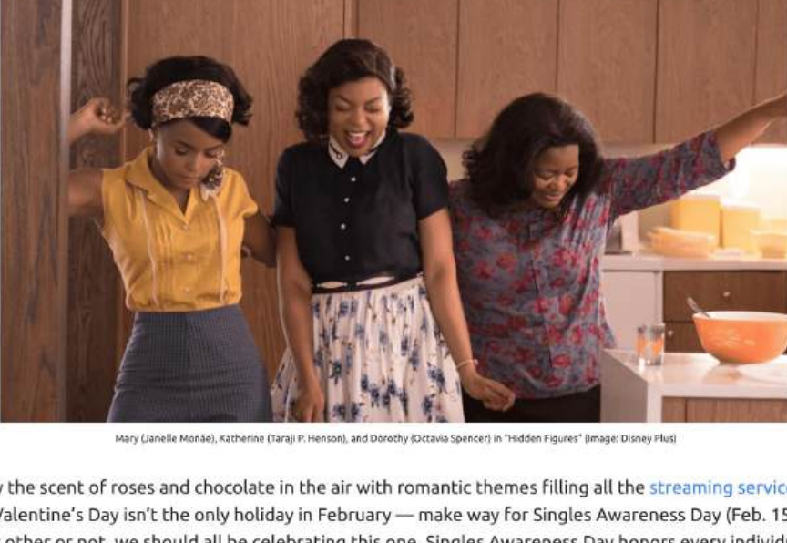
Mary (Janelle Monáe), Katherine (Taraji P. Henson), and Dorothy (Octavia Spencer) in "Hidden Figures"