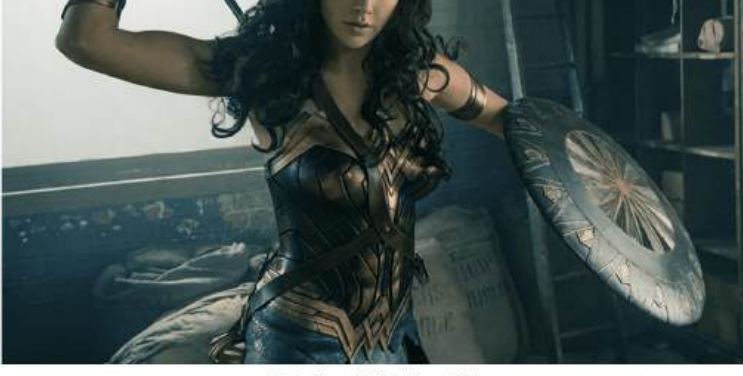
Wonder Woman (Gal Gadot)

For those who enjoy action and classic DC comics, we bet "Wonder Woman" is on your list. And we couldn't agree more! Gal Gadot's performance as Diana of the Amazons is unbeatable. She ventures from the sheltered island where she was raised to discover the entire world at war. She sets off on an adventure to end the war and discover the depths of her power.