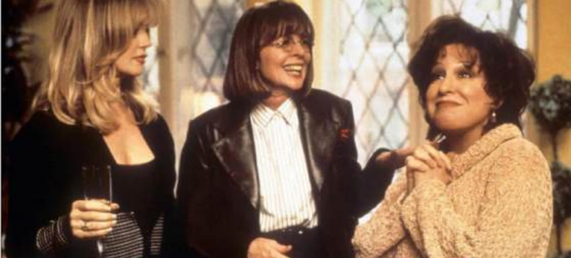
Elise (Goldie Hawn), Annie (Diane Keaton), and Brenda (Bette Midler)

This 1996 film is a classic and perfect for any group of single women to watch on girls' night. Three recently divorced women plot to take action against their ex-husbands who left them for younger women. These ex-wives are devious, clever, and on a mission to get even. With the perfect casting of Goldie Hawn, Diane Keaton, and Bette Midler, you'll be howling with laughter.