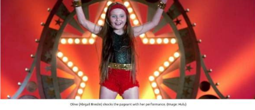
Olive (Abigail Breslin) shocks the pageant with her performance.

This oddly heartwarming film is all about being yourself and celebrating it. What better way to enjoy Singles Awareness Day than watching Abigail Breslin rock out to "Super Freak" with her family cheering her on? Although a bit unorthodox, this movie is all about loving your family and who you are.