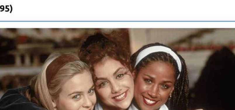
Cher (Alicia Silverstone), Tai (Brittany Murphy), and Dionne (Stacy Dash)

Now you may be thinking, how does this movie fit on this list? It may be a rom-com where everyone winds up with who they're supposed to, but it also celebrates female friendship. The entire movie is about Cher (Alicia Silverstone) helping Tai (Brittany Murphy), admittedly for self-centered reasons. Still, by the end, she just wants what's best for everyone and does everything in her power to make it happen.