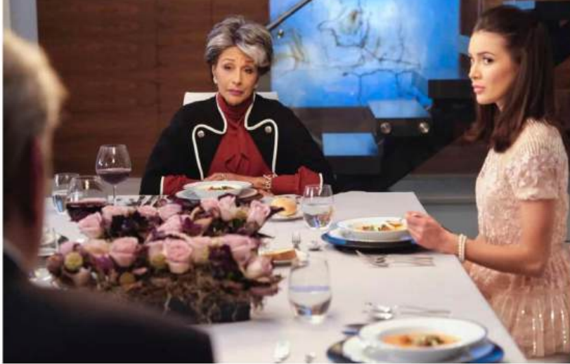
Families play a huge role in the series.

At the very beginning, Bess is seeking out her long-lost family. The Marvins are a prominent family in town and central in Seasons 1 and 2. However, the last two seasons are lacking the Marvins. Bess is cast out from the family, and that seems to be the end of it.