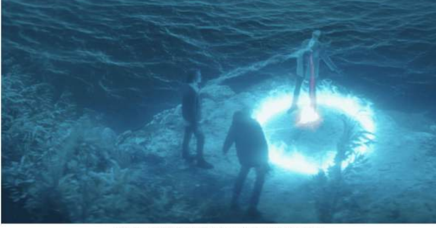
A series finale isn't complete without an epic battle.