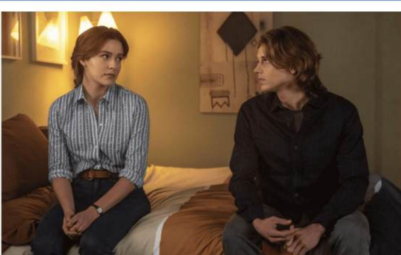
Some loose ends are finally tied up.

We've been waiting for Ace and Nancy to get together for four seasons. Just as they were beginning to understand their feelings for each other in Season 3, they're cursed by Temperance. If Nancy and Ace were to act on their feelings, then Ace would die. The two fight for their love in the first half of Season 4. However, after a failed attempt to break the death curse that left Nancy in the hospital, Ace decides it's too dangerous for them to continue.