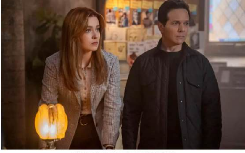
The Drews are wholesome to watch.

I'm a fan of how the CW ended the Drew storylines. At the beginning of Season 1, Drew is worried about Nancy. She's grieving over the loss of her mother and has decided to stay in Horseshoe Bay instead of going away to college. Likewise, Nancy worries about her father and thinks she can't leave him alone.