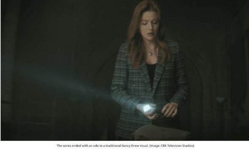
The series ended with an ode to a traditional Nancy Drew motif.

By Rebecca Carlyle | Last modified: September 21, 2023