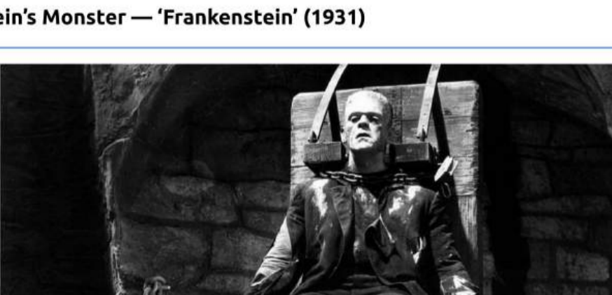
Frankenstein's Monster (Boris Karloff) is chained to a chair.

Some of us have read Mary Shelley's novel "Frankenstein," but for those who haven't, it's crucial to highlight that Frankenstein's Monster (Boris Karloff) was gentle-souled and didn't want to hurt anyone. His scary-looking demeanor was just too much for the townspeople to overlook. How would you feel if you were pieced together, brought back to life, and chased around by townsfolk with pitchforks?