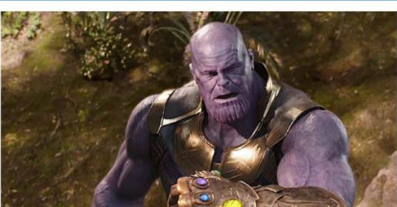
Thanos (Josh Brolin) wearing the gauntlet.

I know, Thanos (Josh Brolin) was committing mass genocide, but hear me out. He lived through the devastation of his planet due to overpopulation. Traumatized from losing his family, friends, and planet, he sets his sights on saving humanity from itself. Yes, he went about it the wrong way, but his heart was in the right place.