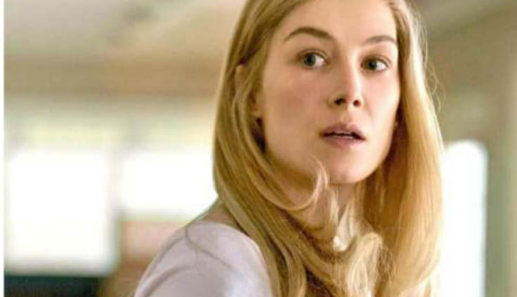
Amy (Rosamund Pike) reflects what people want to see.

This book-to-film adaptation truly held up, giving audiences something to ponder. Is Amy Dunne (Rosamund Pike) a victim or not? Did Nick Dunne (Ben Affleck) deserve what Amy did to him? Framing your husband for your murder is a bit extreme, but it could be argued that she had a mental breakdown. She grew up with the "Amazing Amy" books supposedly based on her, although they made her sound more well-behaved than she actually was. What happens if you can't live up to the life you imagined for yourself? Plus, Nick wasn't that good of a husband.