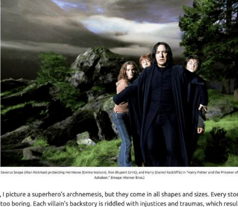
Severus Snape (Alan Rickman) protecting Hermione (Emma Watson), Ron (Rupert Grint), and Harry (Daniel Radcliffe) in "Harry Potter and the Prisoner of Azkaban."