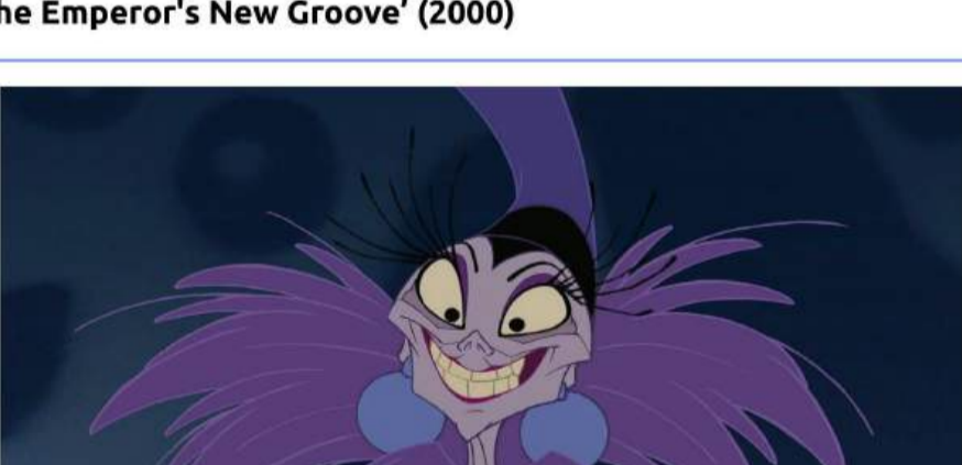
Yzma (Eartha Kitt) always has a scheme up her sleeves.

We all remember Yzma (Eartha Kitt) as a ridiculous, overly dramatic character in "The Emperor's New Groove," and she was. She was fun to watch and laugh at, but if we thought about why she went down such a path of treachery, it was because she was tired for not being young or pretty enough. Honestly, I'd be rather pissed off too.