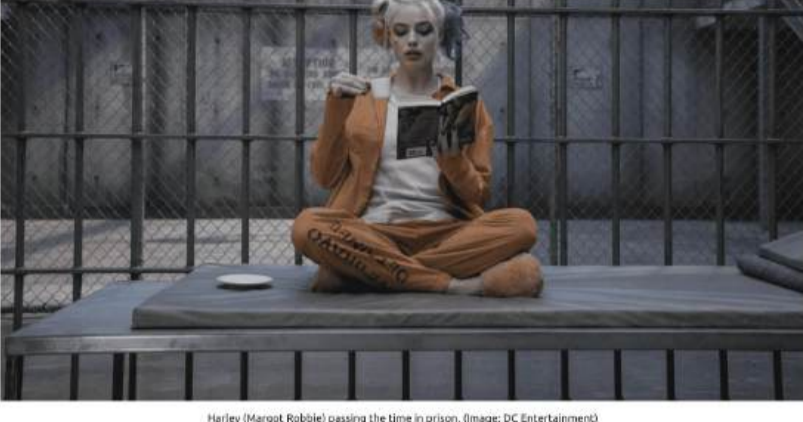
Harley (Margot Robbie) passing the time in prison.

The name Harley Quinn is familiar to those who grew up with Batman cartoons on Nickelodeon or the DC comics. Some of us — the casual fans — didn't know her back story, just that she was the Joker's sidekick. In "Suicide Squad," Harley (Margot Robbie) kicks off the shackles and becomes the protagonist in her own story. We learn that she grew up in a volatile environment that gave her "daddy issues." Add on top of this the manipulation she received at the hands of the Joker. Harley just wants to be in control of her own life and have her voice heard.