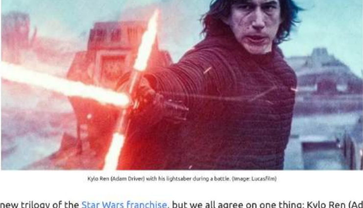
Kylo Ren (Adam Driver) with his lightsaber during a battle.

Not everyone loved the new trilogy of the Star Wars franchise , but we all agree on one thing: Kylo Ren (Adam Driver) was pushed to the Dark Side. Born from Princess Leia (Carrie Fisher) and Han Solo (Harrison Ford), Kylo was raised with high expectations. With all this pressure on his shoulders, Kylo was sent to Jedi training with Luke Skywalker (Mark Hamill). Things got worse when Luke sensed darkness in Kylo and tried to kill him during training. Sure, Kylo went overboard with the revenge part, but his teacher tried to kill him!