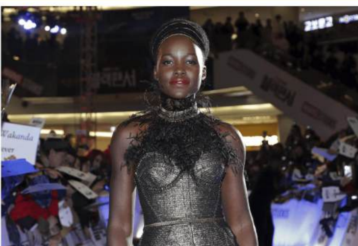
Lupita Nyong'o is as intelligent as she is talented.

Lupita Nyong'o is another accomplished Black woman on the list. After attending graduate school at Yale, she debuted on the big screen in "12 Years a Slave," which won her an Oscar. Talk about starting your career with a bang! She's clearly an intelligent woman (Fun Fact: She's fluent in four languages!) with a load of talent. She also has a children's book available titled "Sulwe"; it's about a girl who learns to love her "midnight skin." Lupita Nyong'o is an actress to keep an eye on!