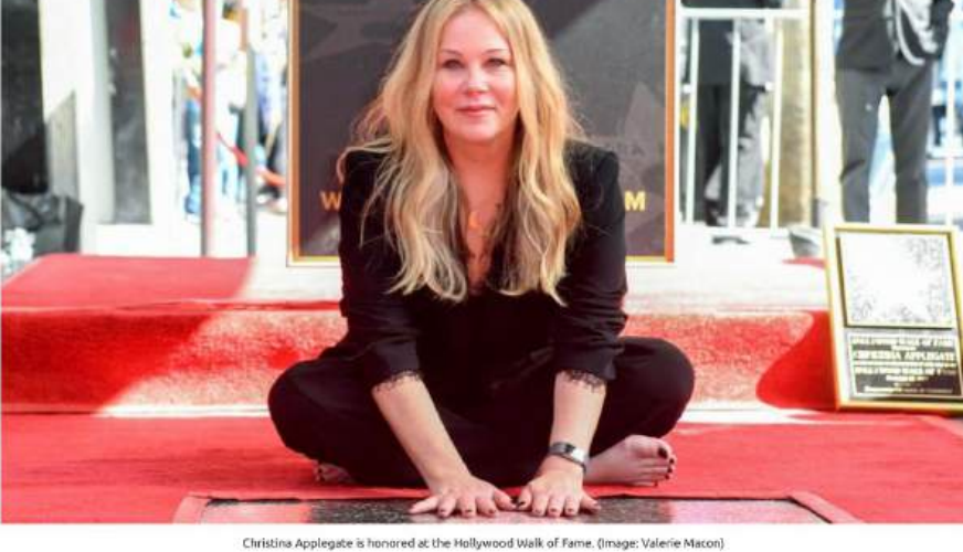
Christina Applegate is honored at the Hollywood Walk of Fame.

Christina Applegate has had a long career — her first acting credit dates back to 1972 — and you've probably seen her in a million things. Sadly, she hinted at the 2023 SAG Awards that she might be retiring soon, stating that the awards show will probably be her last as an actress. While she's known for her humor and being generally kind and loving, we appreciate how she's handled her multiple sclerosis diagnosis. She is outspoken and candid about what it's been like living with the disease.