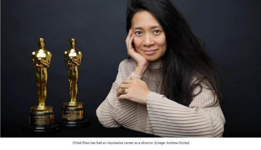
Chloé Zhao has had an impressive career as a director.

Chloé Zhao, originally from Beijing, China, moved to the U.S. in high school. She went to the New York University Tisch School of the Arts after acquiring her bachelor's degree in political science. Since 2010, she has quickly garnered acclaim for films such as "Songs My Brother Taught Me" and "The Rider." She's known as an indie film director but made the leap to Marvel with "Eternals" in 2021. Wherever she goes, she leaves a mark with her specific Zhao style.