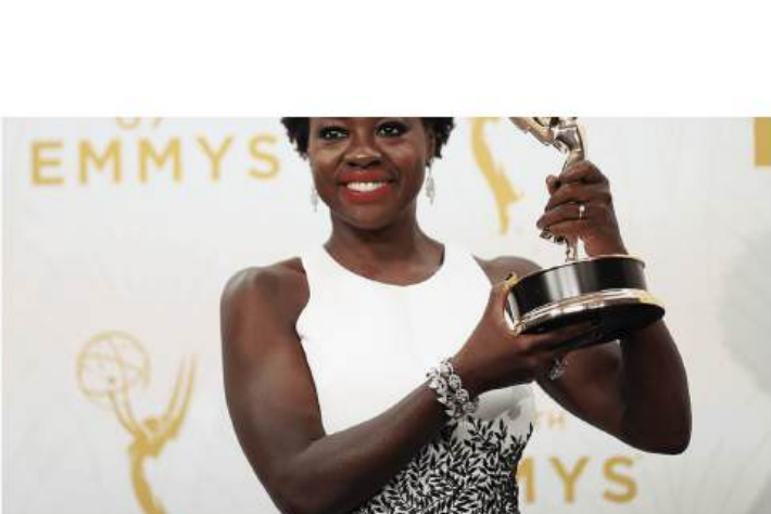
Viola Davis is an influential figure on perseverance.

Viola Davis is a powerful yet humble actress. She has the ability to play a wide variety of characters, portraying drastically different personality traits. She grew up in an impoverished household amid domestic abuse. The EGOT-winning actress is known for precise and controlled performances. At the ASV Awards, she stated she's "committed to bringing Black women to the forefront." With her work in films like "The Help," "Fences," and most recently "The Woman King," we think she's achieving that goal.