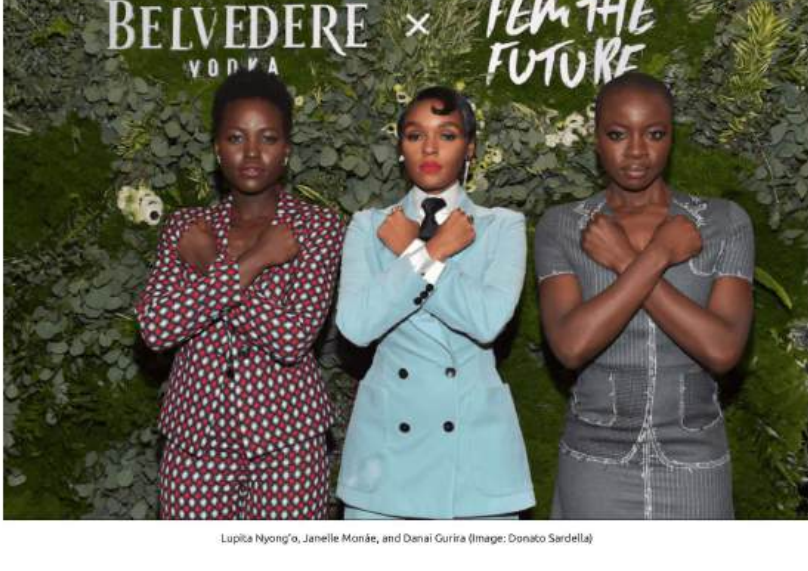
Lupita Nyong'o, Janelle Monáe, and Danai Gurira