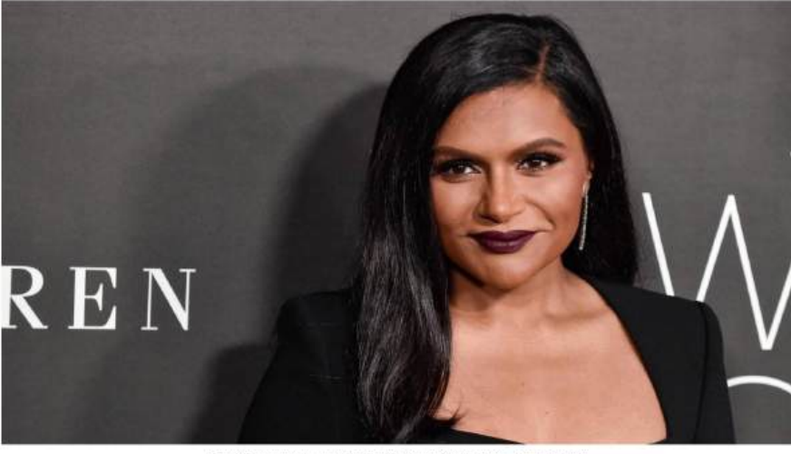
Mindy Kaling has been a comedic voice for almost 20 years.

Mindy Kaling quickly shot to fame during her time on "The Office" as Kelly Kapoor, but her involvement didn't stop there. She was one of the many writers on the show and a producer. While she's most known for her role as Kelly and her TV show, "The Mindy Project," Mindy has appeared in many comedic films, such as "The 40-Year-Old Virgin" and "Late Night." Her advocacy of Indian voices includes Mindy's Book Studio with Amazon and writing for Netflix's "Never Have I Ever."