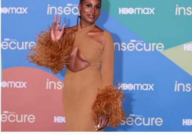
Issa Rae is a champion of Black voices.

Issa Rae is a name we're all familiar with; she's written, produced, and acted in a myriad of critically acclaimed shows and movies. Her career began with her YouTube web series "Awkward Black Girl," which quickly drew attention. Since then, she has produced and starred in "Insecure" and played an activist in "The Hate U Give." She focuses on projects that amplify Black voices and depict the Black lived experience. The Emmy-nominated actress is certainly a name to watch; we're sure she isn't done yet.