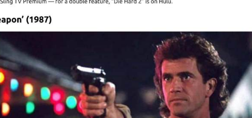
"Lethal Weapon" is the ultimate Christmas movie.

If you consider "Die Hard" a Christmas movie, then you'll have no problem giving my logic here, especially since "Lethal Weapon" is even more Christmasy. Martin Riggs ( Mel Gibson ) is a cop with suicidal tendencies, but he always gets the job done. When he's paired with Roger Murtaugh ( Danny Glover ), an older cop who's thinking about retiring, the two must work out their differences in order to stop a drug smuggling gang. There's no arguing that this is a Christmas movie — not when one of the fight scenes takes place in a tree lot!