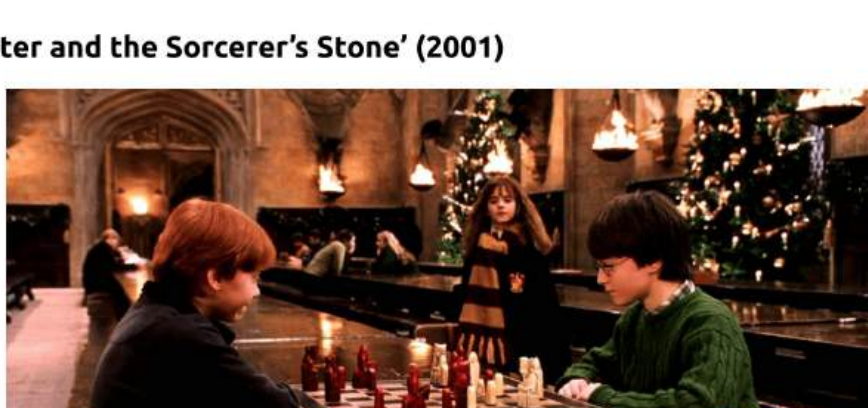
One only has to look as far as Mrs. Weasley's acceptance of Harry into her family to find the Christmas spirit.

Not only is "Harry Potter and the Sorcerer's Stone" a Christmas movie, but so is the entire franchise. On the surface, the series is about magic and coming of age, but it has deeper themes of friendship, family, and coming together. Plus, thoughts of the Wizarding World conjure images of the Hogwarts castle draped in snow and the giant tree in the Great Hall.