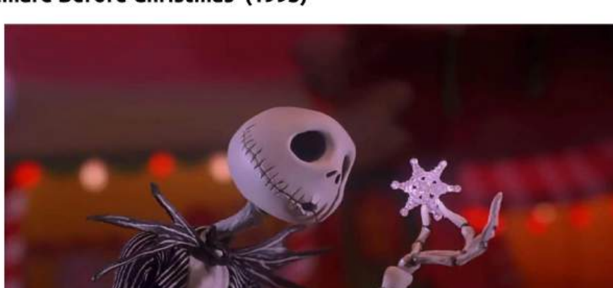
What's more Christmasy than the Pumpkin King learning to love Christmas for what it is?

This next film on our list is one of the most controversial Christmas movie debates. Tim Burton's stop-motion movie "The Nightmare Before Christmas" can work for both Halloween and Christmas. Jack Skellington ( Chris Sarandon ) is the Pumpkin King from Halloween town. He becomes tired of his everyday life, doing the same things and scaring the same people of the "real world." He discovers Christmastown, and a plot forms in his mind to kidnap Santa Claus and rule in his place. However, his plot doesn't work out as planned. Like so many others, Jack falls in love with Christmas.