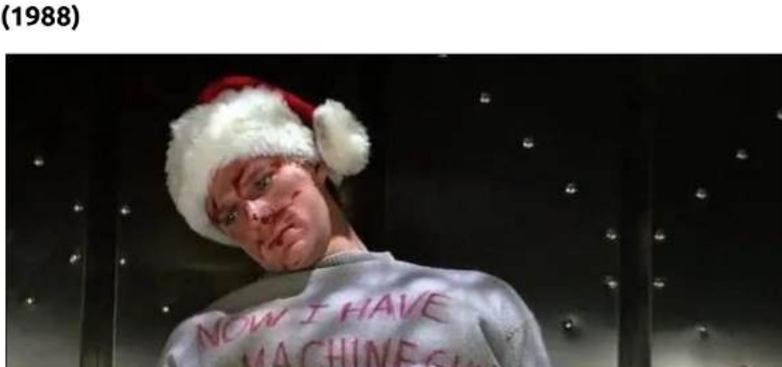
"Die Hard" is the definition of a Christmas movie. After all, John McClane is just trying to reunite with his family.

"Die Hard" is one of the most controversial Christmas movies. With Christmas music and decorations a constant throughout the film, we firmly believe this is a holiday movie. Set during a holiday office party, John McClane ( Bruce Willis ) is in town to visit his estranged wife, Holly ( Bonnie Bedelia ), but the office is taken hostage. To ensure his wife's safety, NYPD officer John takes matters into his own hands. What sparks more holiday magic than reuniting with family?