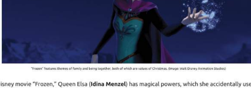
"Frozen" features themes of family and being together, both of which are values of Christmas.

In the beloved Disney movie "Frozen," Queen Elsa ( Idina Menzel ) has magical powers, which she accidentally uses to turn her home into an icy kingdom. When she banishes herself into exile for the mistake, it's up to her sister Anna ( Kristen Bell ), quirky mountain man Kristoff ( Jonathan Groff ), his trusty reindeer, and Olaf ( Josh Gad ), a snowman come to life, to bring Elsa home.