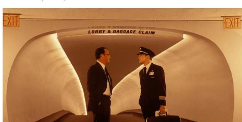
Anything set during the holiday season makes it a Christmas movie.

"Catch Me If You Can" should be on your watch list, even if it's only because of the amazing cast. Skilled forger and con man Frank ( Leonardo DiCaprio ) passes himself off as a doctor, lawyer, and finally a pilot. FBI agent Carl ( Tom Hanks ) becomes obsessed with tracking Frank down. You may be thinking, how is this a Christmas movie? It's set during Christmastime, and we believe any movie set during the holiday season is a Christmas movie!