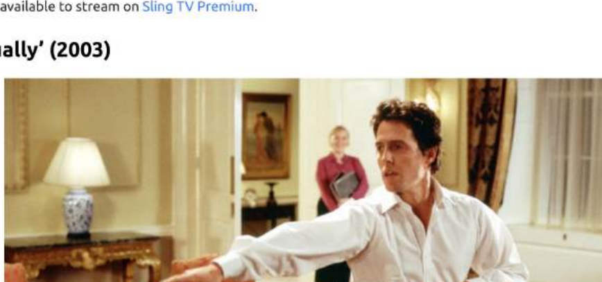
"Love Actually" depicts how Christmas can look different to everyone.

"Love Actually" is set during the Christmas season, but it can be argued that it's just a rom-com. It was, after all, marketed as "the ultimate romantic comedy." The film follows eight couples whose lives are loosely intertwined. The movie is centered around love stories, but it's certainly wrapped up with Christmas bows, including a children's Christmas pageant, gift shopping, and a holiday office party.