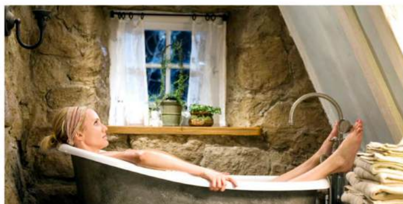
Family is what you make it.

Another girls'-night classic, "The Holiday" is about two women experiencing relationship woes and switching homes (and countries) for a getaway. The film's title may reference their vacations, but it can also be attributed to the time of year. They travel to new towns to stay in a stranger's home during — you guessed it — the holiday season. The movie showcases a holiday party and grocery shopping in a decked-out market, but it's about creating your own family. What's more Christmasy than finding happiness and family?