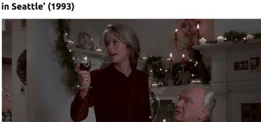
Sleepless in Seattle is a holiday classic, due to its storyline of love and happiness.

Widow Sam ( Tom Hanks ) relocates to Seattle with his son Jonah ( Ross Malinger ) to escape his grief. Eighteen months later, on Christmas Eve, Sam goes on a radio show and tells the story of his late wife Maggie, effectively making every woman listening fall in love with him, including Baltimore reporter Annie ( Meg Ryan ). This movie is not only about falling in love, but also about finding happiness again. What better time of year is there to watch this classic than Christmastime?