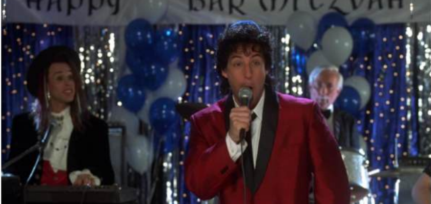
"The Wedding Singer" is one of Sandler's more loved rom-coms.

Sandler usually plays over-the-top characters, so I was surprised to see him in a role where he wasn't. I expected to cringe at his performance in "Hustle," but I enjoyed it. Sandler's character, Stanley, is downtrodden. He's spent his time scouting potential players for the NBA team, the 76ers. All he wants is to be home with his wife and children and to be the assistant coach. Throughout the film, his luck seems to turn on him, and only his perseverance and passion land him on top in the end.