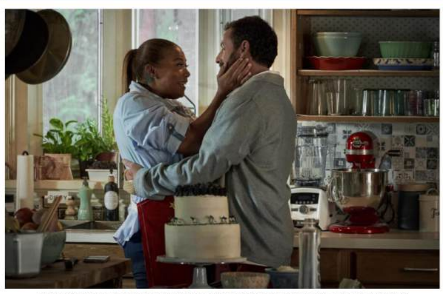
The support this couple showed each other is commendable, and I wish Queen Latifah had more screen time.

Sandler is no stranger to having relationships on screen . He's always had good chemistry with the women he's paired with, like Drew Barrymore in "50 First Dates" and Jennifer Aniston in "Murder Mystery." It's hard to say if they match his energy or if he matches theirs. For his two drama films, I can say that Sandler matched Mulligan and Queen Latifah 's energy.