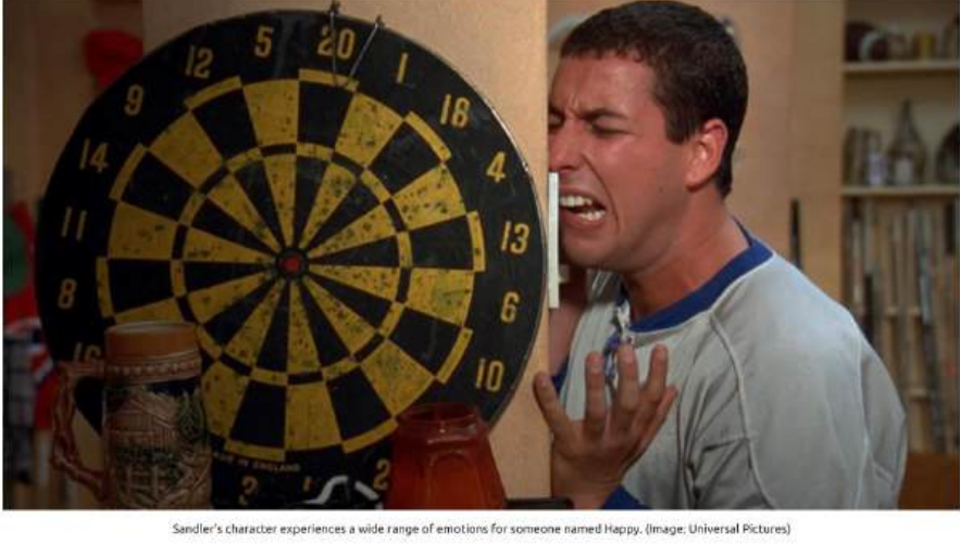
Sandler's character experiences a wide range of emotions for someone named Happy.

With Sandler, I think of all the excessive facial expressions that go hand in hand with his overacting. Sandler fans know what I'm talking about. He has a crying face and an angry face, just to mention the iconic ones (see the photo above for his crying face!).