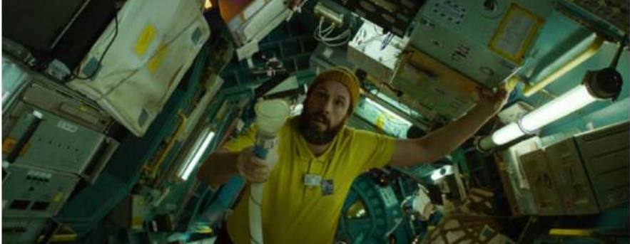
Loneliness can be debilitating, but it doesn't stop this astronaut from doing his job.

Lead male actors usually have six-pack abs and chiseled jawlines. While I have nothing against some eye candy, it often takes away from the story's believability. This is another reason why I love that Sandler was chosen for "Hustle" and "Spaceman." He's got that average Joe look, making him more relatable to audiences. The underacting method combined with his dad-bod figure creates a real caricature that's easy to believe.