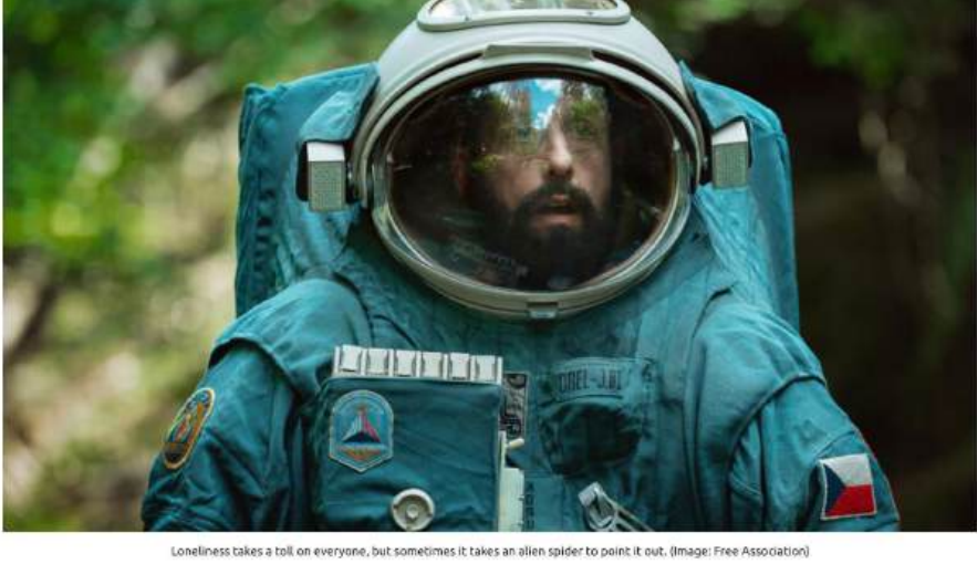
Loneliness takes a toll on everyone, but sometimes it takes an alien spider to point it out.