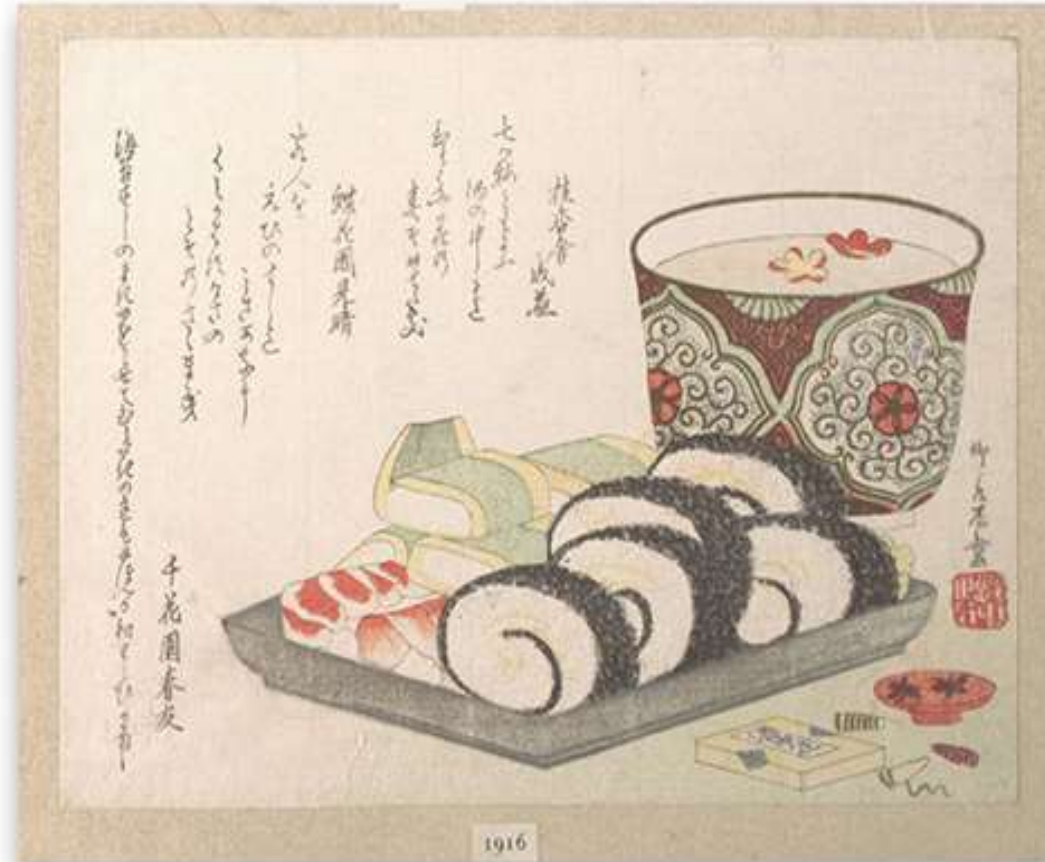
Example of an artwork suggested by “My Met, My Life.” Image courtesy the Metropolitan Museum of Art (Kinsella, 2019).