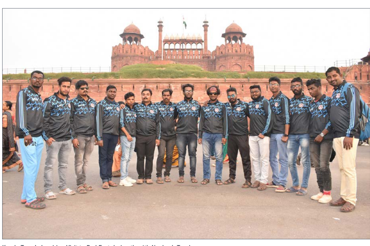
Kerala Team's Inspiring Visit to Red Fort during the 4th Naghesh Trophy.

Kerala Team's Memorable Visit to QutubMinar during the 4th Naghesh Trophy