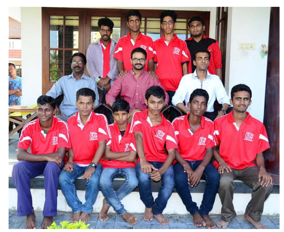
Kerala Team Graced by Film Star Jayasurya.