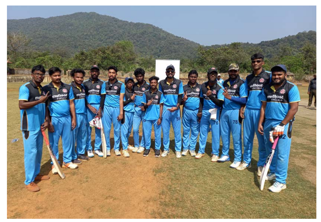
Interstate Invitational Cricket Tournament for the Blind hosted in the scenic setting of Goa.

Kerala's Men's Team in action during the 5th Edition of the Naghesh Trophy.