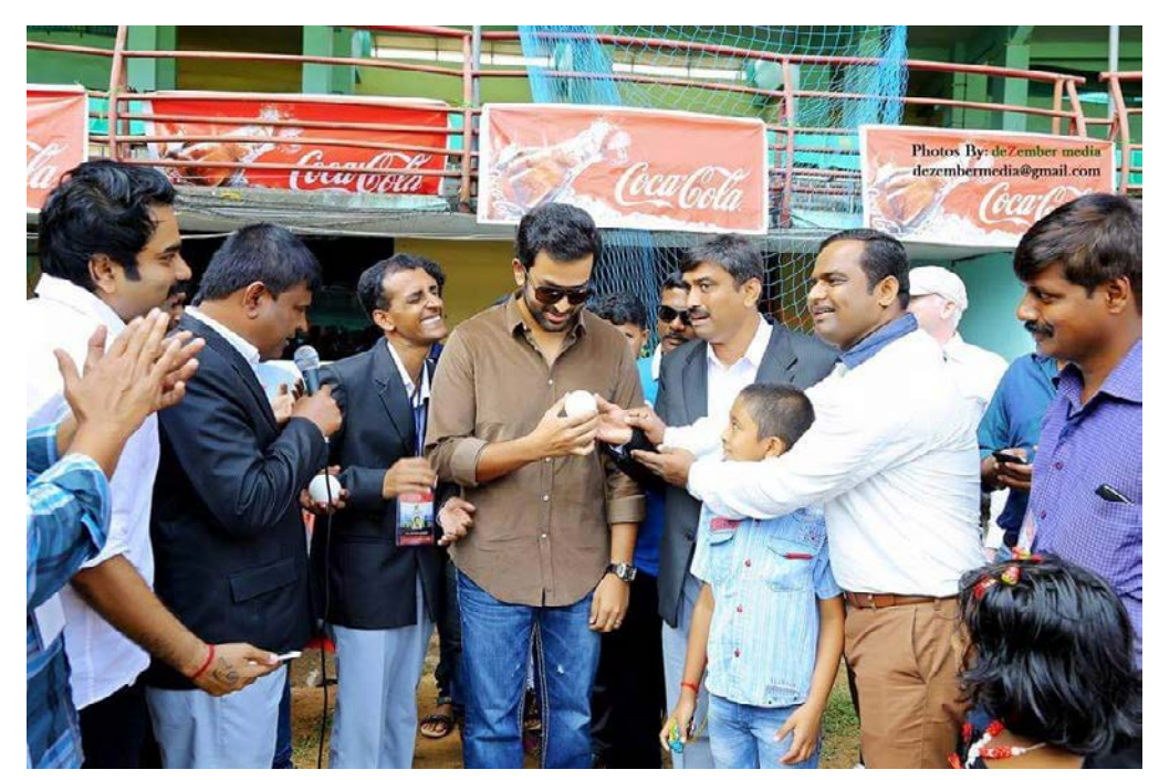
Vibrant and Youthful Presence of Film Actor Prithviraj during the Asia Cup Event.

Indian Team's Commemorative Moment with Former Chief Minister OommenChandy and MLA K Babu After Asia Cup Triump.