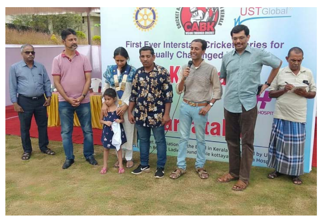
Fierce Encounter: Kerala Women's vs. Karnataka Women's Inter-State Cricket Tournament for the Blind.

Intense Clash: Kerala vs. Karnataka Inter-State Cricket Tournament for the Blind.