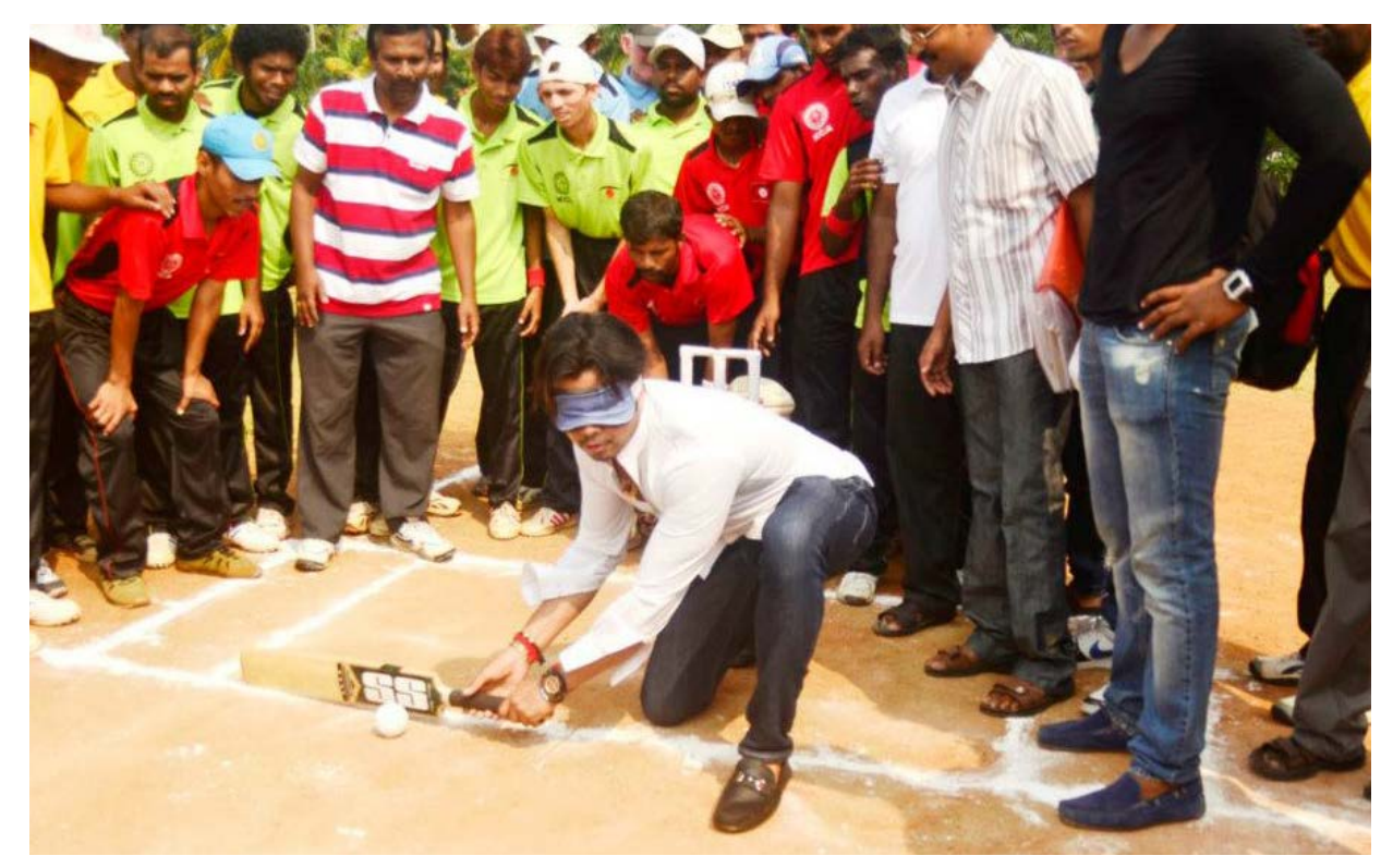
Kindling Competition: S Sreesanth Sets In Motion the National Challenger Trophy of 2012.

When Glamour Met Grit: Film Actress Bala and Singer Amrutha Suresh radiate the Inaugural Edition of All Kerala Cricket Tournament.