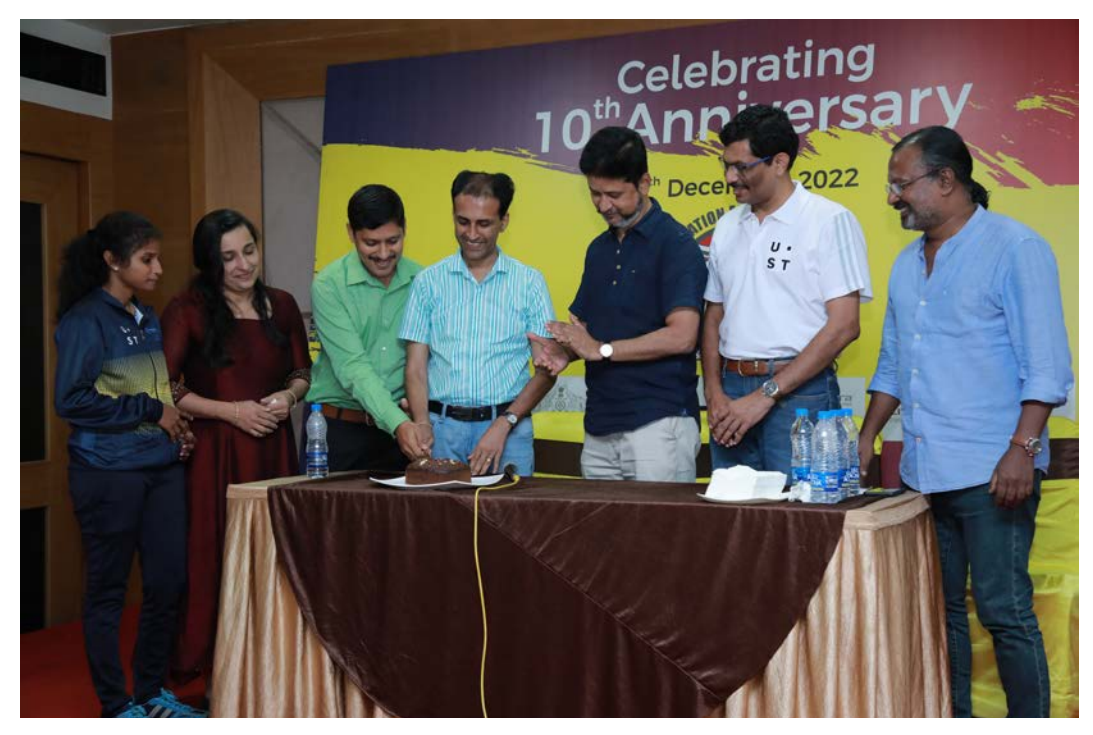
A Decade of Glory: CABK's 10-Year Celebration.