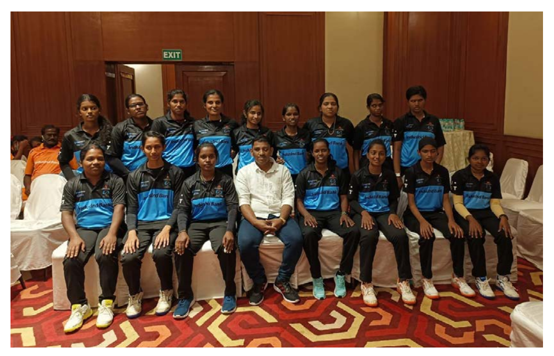
2nd National Women's Cricket Tournament for the Blind: Kerala Team's Participation in Bangalore.