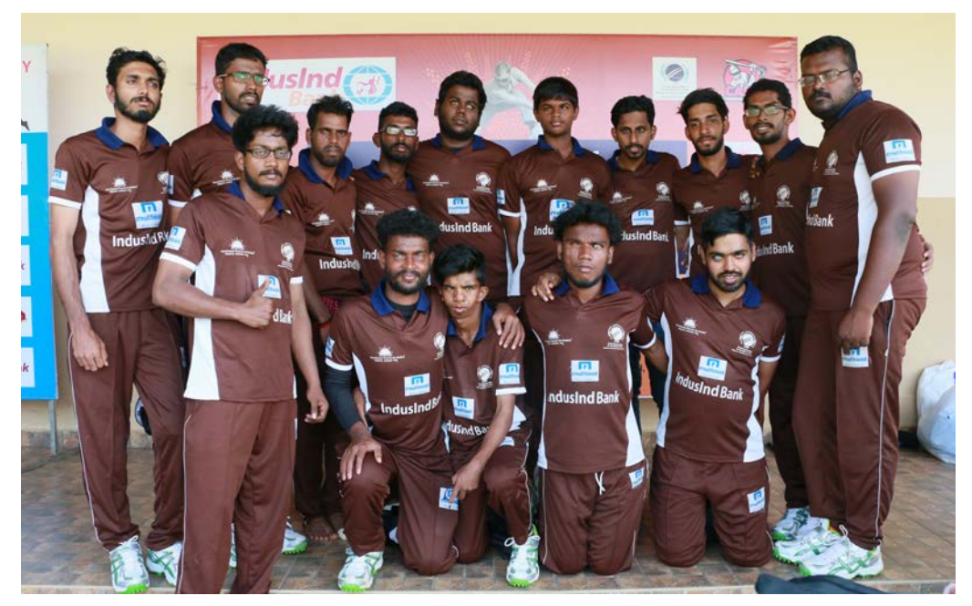
Kerala Team's Debut in the Nagesh Trophy: A Remarkable Entry into Blind Cricket's Arena.

Kerala Players Participating in Alergan Training Camp, Bangalore: A Step Towards Skill Enhancement.