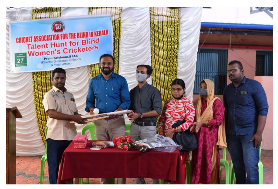
School Visit Commenced by Sports Director at Trivandrum Blind School.

Displaying Expertise: Inter State Invitational Cricket Tournament for the Blind at Pondicherry.