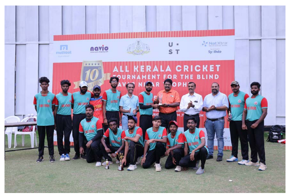
A Decade of Excellence: 10th Edition All Kerala Cricket Tournament (Navaz Nizar Trophy) for the Blind.