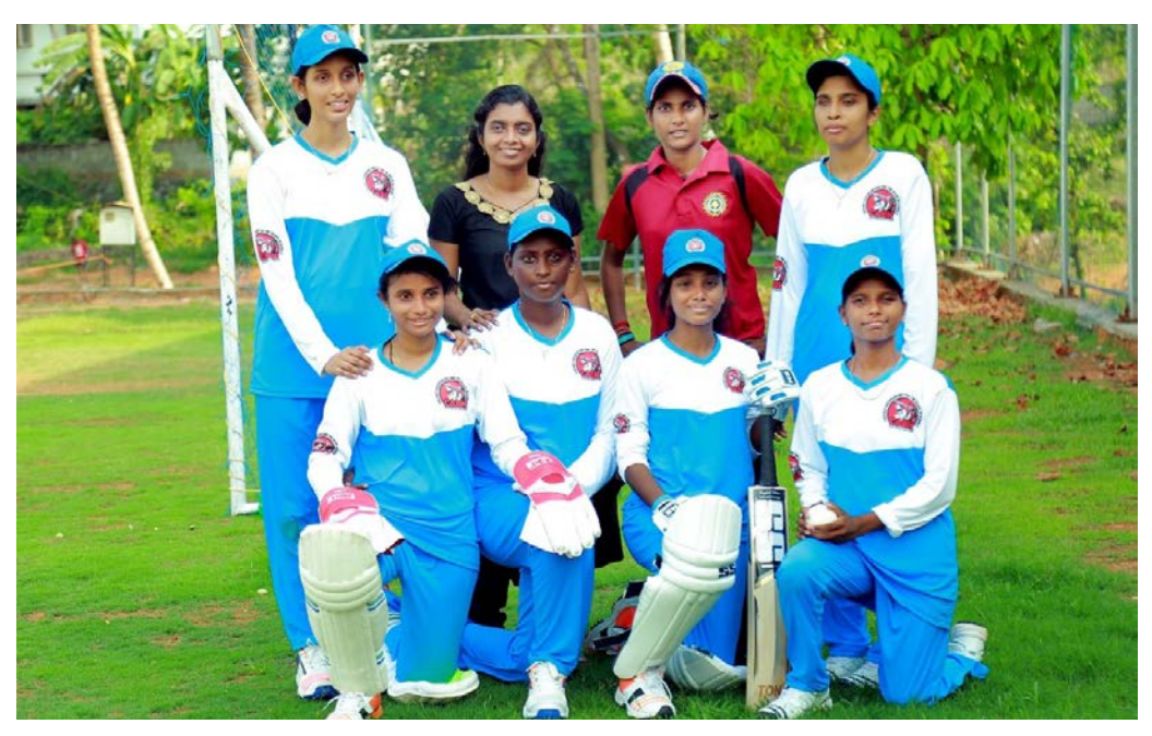
Inaugural Kerala Women's Blind Cricket Team: Pioneering New Horizons.