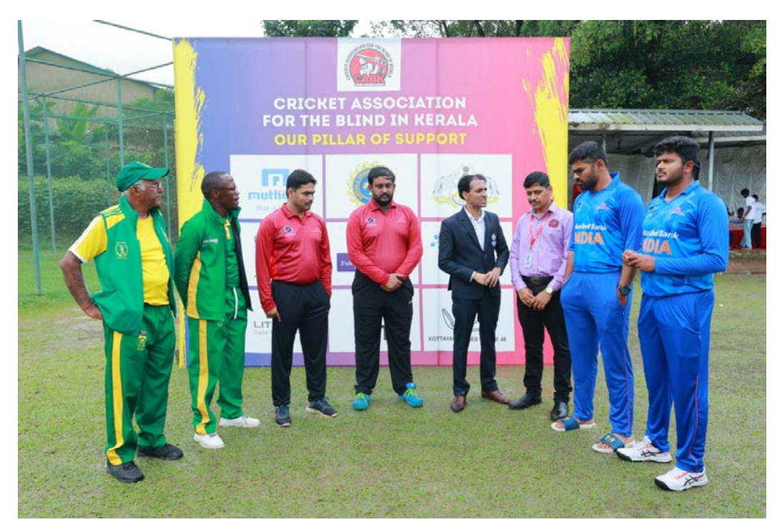
Captains in Focus: India & South Africa Team Leaders at the 3rd T20 World Cup Cricket Tournament for the Blind.

Symphony of Triumph: 3rd T20 World Cup Cricket Tournament for the Blind.