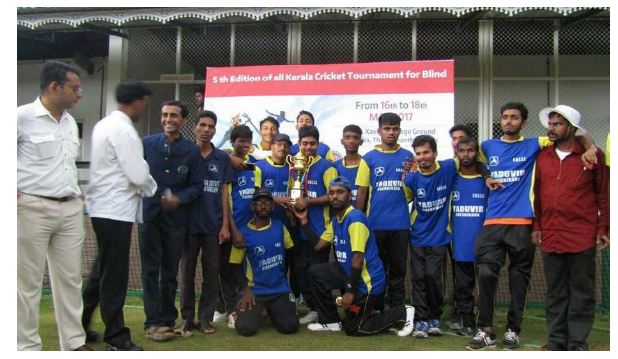
Fifth Iteration of All Kerala Cricket Tournament for the Visually Impaired.