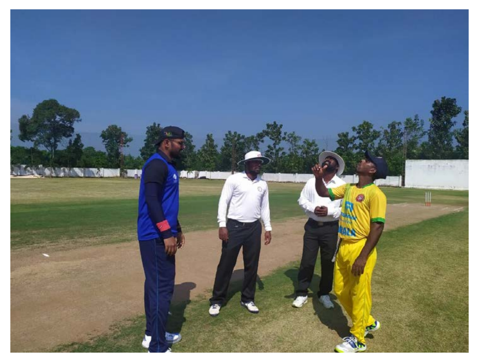
Inter-State Showdown: Kerala vs. Andhra Pradesh Cricket Tournament for the Blind.