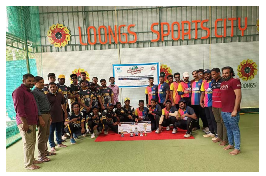
A Pinnacle of Passion: The 9th Edition of All Kerala Cricket Tournament for the Blind.