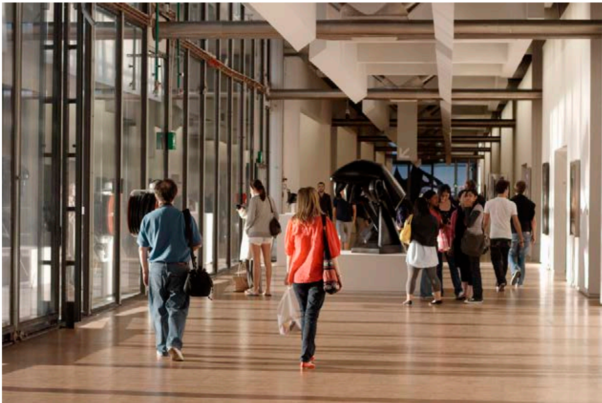
Centre Georges Pompidou from inside.