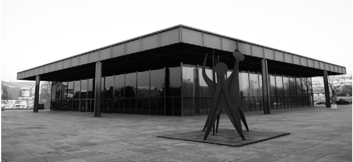
Neue Nationalgalerie by Ludwig Mies van der Rohe.

Greenberg, «if interiors were remodeled, the exteriors remained the same» (Greenberg, 1996). Neoclassical facades of many of these institutions sharply contrasted with the chaotic interiors of their galleries, which exemplified disunity between exterior and interior architecture. This dual identity of European institutions in which modern art was displayed during this period prompted some curators to reexamine the types of spaces best suited for the display of new art forms. In the following decades, museum galleries became more homogenized, perhaps due to a more globalized art market.