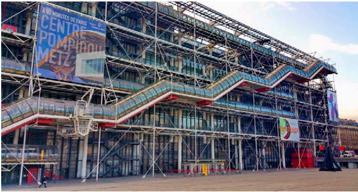
Centre Georges Pompidou.