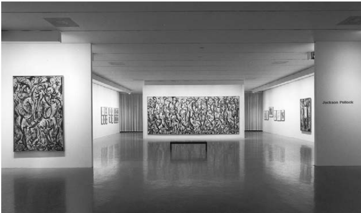
White cube installation methodology in the exhibition Jackson Pollock, April 5–June 4, 1967.

asserted that there was, «No negative effect –development was based on creating enhanced spaces appropriate to a range of contemporary art forms and materials– architecture [was] based on [the] principle of enhancing [the] presentation of and access to art, not to draw attention to [the] architecture itself». Although this respondent claimed that the architecture had no negative impact upon the display of their collection, based on the feedback, it appears that the architectural program was designed with the collection already in mind. This design strategy, then, must have been implemented at the planning's outset. In some instances, art informed the architecture, as one respondent noted, «The museum architecture was partly shaped by contemporary art [...] the exhibition spaces from floor 2 to 8 are black boxes, which combine different types of objects and to create transcultural and transhistorical presentations. In our exhibitions we collaborate with contemporary artists which have meaningful work in relation