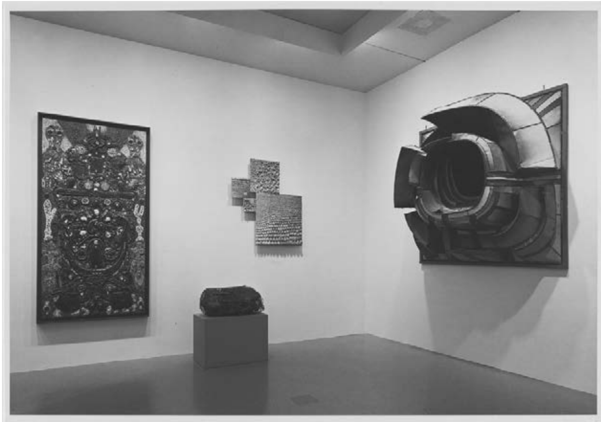
Installation view of the exhibition, The 1960's: Painting and Sculpture from the MoMA Collection . June 28, 1967–September 24, 1967. Photographic Archive. The Museum of Modern Art Archives, New York. IN834.5. Photograph by James Mathews

offer the types of spaces required of a museum in the twenty-first century. It seems that the band-aid approach of either reskinning the exterior to buildings at the cost of the interiors or building anew prevailed.