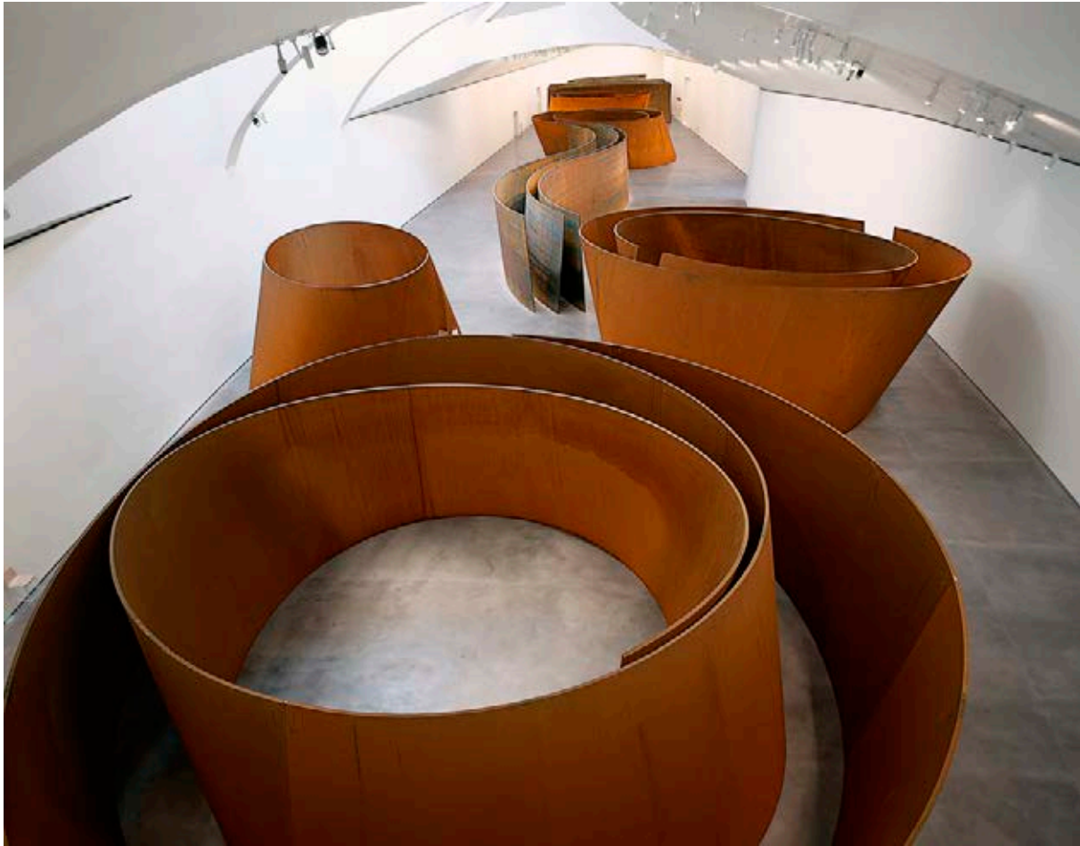
Richard Serra, The Matter of Time, 2005. Installation of seven sculptures, weatherproof steel, varying dimensions. Guggenheim Museum, Bilbao, GBM1996-2005. © 2018 Richard Serra / Artists Rights Society (ARS), New York.

of the Cold War, the rise of the World Wide Web, and a more globalized art world, which continues today at a rapid pace. It was a year of transition punctuated by the momentous uprising of Chinese students in Tiananmen Square. It was also the year of the United States government's conservative attack on artistic expression as witnessed by scandalous censorship efforts and cancellations of so-called controversial exhibitions (the most publicized example was the cancelling of the Robert Mapplethorpe retrospective at the Corcoran Gallery in June of that year) by the National Endowment for the Arts. Subsequently, the year 1994 witnessed the end of apartheid in South Africa and the creation of the North American Free Trade