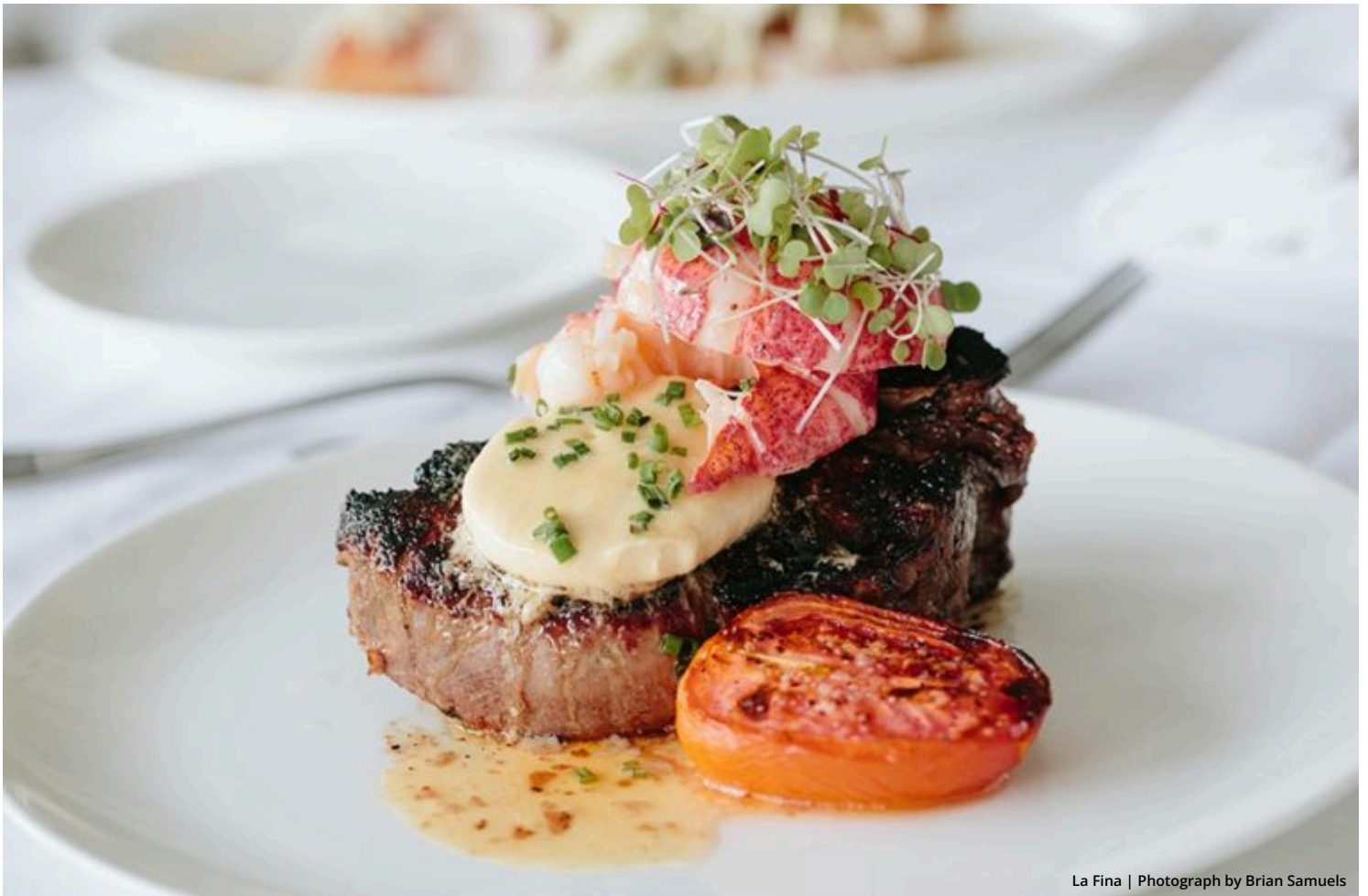
La Fina