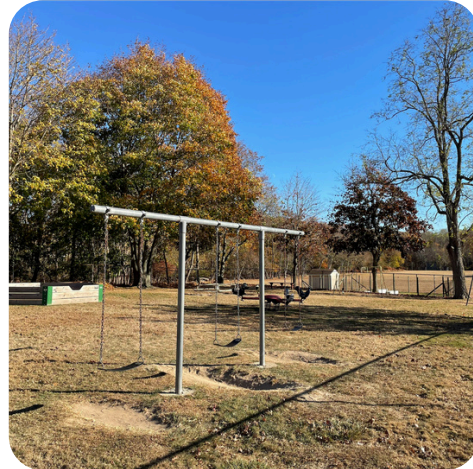
The current playground in need of remodeling

Thanks to a generous donor, Little Flower is expanding the Macrone-Davis Arts Center into an even more dynamic educational and therapeutic space. In partnership with East End Arts Council, we hired a music teacher to teach the youth essential music skills. Music fosters confidence, leadership, and social-emotional growth, making this initiative even more impactful.