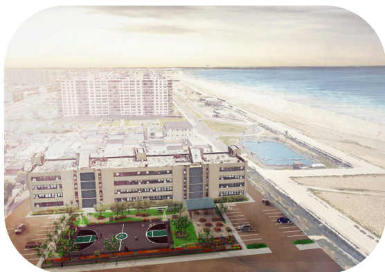
Artists' rendering of plans for play yard

From day one, St. John's provides thorough case planning, fair futures support and dedicated aftercare services, ensuring each youth has the tools, skills, and support to thrive as an independent and empowered member of the community. By combining structured support with opportunities for personal growth, the program sets youth on a path toward a successful future.