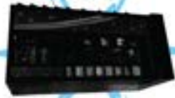
Fully Mechanical Vending Machine

No contest, this is the best vending machine ever made. This thing only accepts quarters, and never more than 4, which means nothing can be overpriced. It never fails to deliver its product. It's also really cool looking since it's non-electronic except for the refrigeration. I've never had an issue with these. I love them with my whole heart.