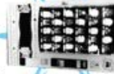
Bowling Alley Sock Machine

I was always disappointed by these as a kid, because I would walk by expecting snacks and it was boring socks. I didn't even use vending machines much back then, I think I just liked looking at the snacks my parents wouldn't let me waste money on. Also, it's 100% your fault if you forget to wear socks while bowling you weirdo.