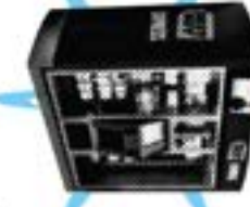
Best Buy Express

I remember seeing this for the first time in an airport and thinking it was cool. I now think this thing is totally absurd. I understand the cheaper headphones, but some of these sell actual tablets. If you need to distract your kid so badly that you impulsive buy an iPad, you need to seek help. Honestly just put your kid up for adoption at that point.