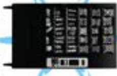
Regular Vending Machine

I say "regular" vending machine because this one to me is the standard for all other vending machines. Very inoffensive, does its job well, and while I see videos online of people's snacks getting stuck, I've never had that happen to me. Doesn't get an A rating due to these inevitably being way over-priced.